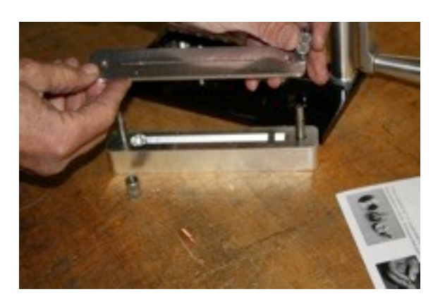
4) Remove the cover of the coil holder, be careful not to lose the springs under the cover.