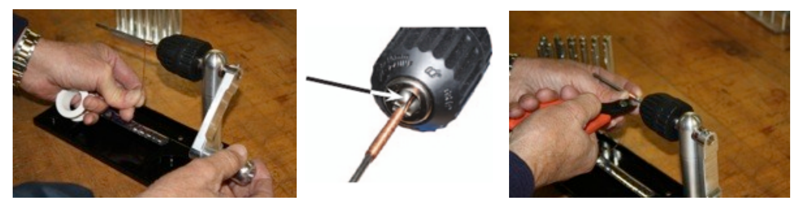
3) Remove the coiled wire from the mandrel. The end that is inserted into the arbor hole may be clipped or lifted out. Clip off or bend either end that may be sticking out above the coil. This will insure that the coil will lay flat in the V bed of the coil holder

2) Insert the end of the selected wire into the hole of the core arbor. If necessary, bend the end of the wire. Please note that on the smaller mandrel sizes 2.5mm, 3mm, 3.5mm & 4mm the wire holding holes have been removed to retain the strength of the mandrel. On these sizes, simply place the end of the wire between 2 of the chuck teeth, bend down and wind as normal. Hold the wire firmly with your left hand and turn the keyless chuck handle clock wise with your right hand. Hold the wire tightly against the coil of wire as you turn the handle. This will produce a nice tight coil which is necessary for clean cutting of the jump rings. The coiled wire should not be longer than 3".