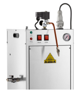
STAINLESS STEEL ENCLOSURE