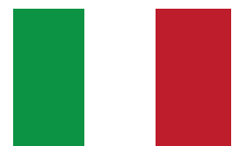
MADE IN ITALY