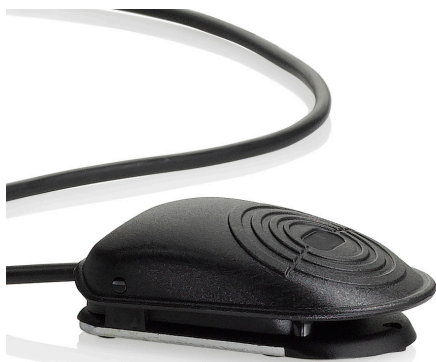
RELGVO28/71 Foot Pedal