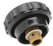
4 SAFETY SYSTEMS