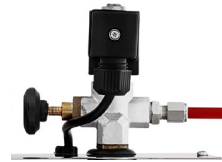
EXTERNAL SOLENOID WITH VARIABLE STEAM DIAL