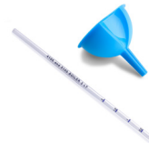
WHATS IN THE BOX