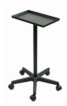
1400IA Boiler Stand