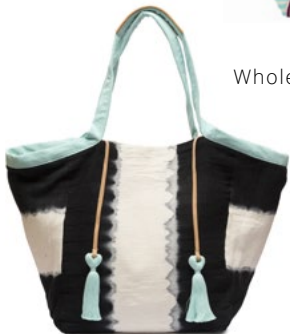
SS2248 | Black Hand Dye Wholesale: $54, MSRP: $118