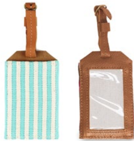
SS2269 | Hierba Buena Wholesale: $11, MSRP: $24