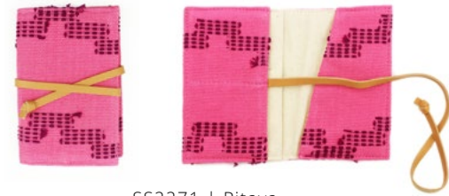
SS2271 | Pitaya Wholesale: $17, MSRP: $38