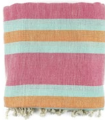
SS2285 | Hierba Buena Wholesale: $45, MSRP: $98