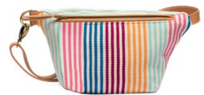
SS2233 | Moras Wholesale: $49, MSRP: $108