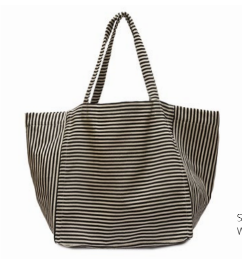
SS2241 | Black and Natural Stripe Wholesale: $35, MSRP: $78