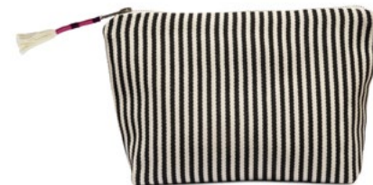
SS2212 | Black and Natural Stripe Wholesale: $22, MSRP: $48