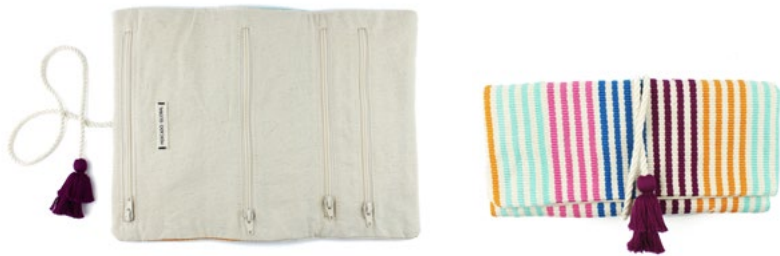
SS2215 | Moras Wholesale: $26, MSRP: $58