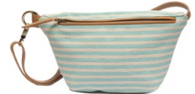
SS2234 | Hierba Buena Wholesale: $49, MSRP: $108