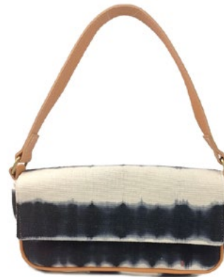
SS2263 | Black Hand Dye Wholesale: $45, MSRP: $98

Introducing this season's silhouette, the Olivia Baguette Bag. Small but mighty, this on-trend handbag is a staple this season and adds a chic and sophisticated twist to any outfit. 5" H x 11" W x 2" D x 10" Strap Drop