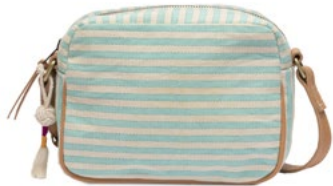
SS2229 | Hierba Buena Wholesale: $49, MSRP: $108