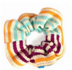
SS2279 | Moras Wholesale: $6, MSRP: $14