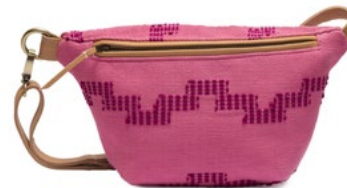
SS2232 | Pitaya Wholesale: $49, MSRP: $108