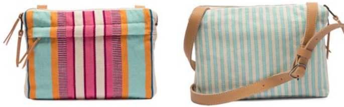
SS2226 | Rabano / Hierba Buena Wholesale: $49, MSRP: $108

The Miriam is our functional double gusset crossbody, perfect for everyday use. Features two top zippers, interior pocket, adjustable strap, and leather detailing. 7.25" H x 10.25" W x 19.5" Strap Drop