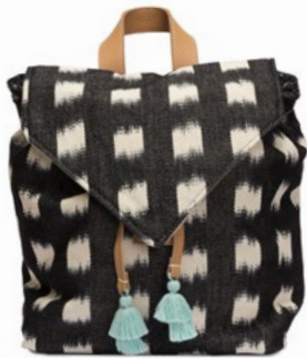
SS2265 | Black Window Pane Jaspe Wholesale: $63, MSRP: $138