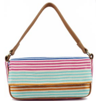
SS2287 | Moras Wholesale: $45, MSRP: $98