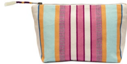
SS2208 | Rabano Wholesale: $22, MSRP: $48

This utilitarian travel pouch fits neatly into a tote or luggage to organize your small goods, from bikinis to toiletries. Water-resistant lining and leather zip pull. 7" H x 12" Top W x 8" Bttm W x 3" D