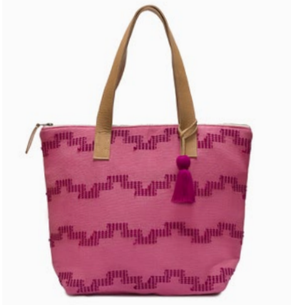
SS2250 | Pitaya Wholesale: $63, MSRP: $138