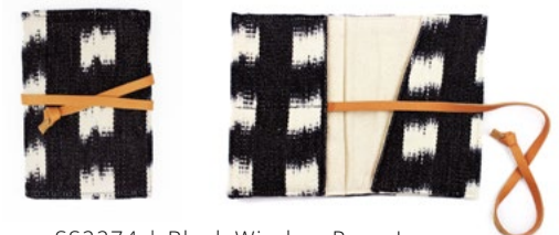
SS2274 | Black Window Pane Jaspe Wholesale: $17, MSRP: $38