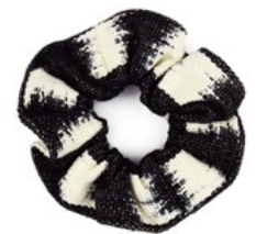
SS2281 | Black Window Pane Jaspe Wholesale: $6, MSRP: $14