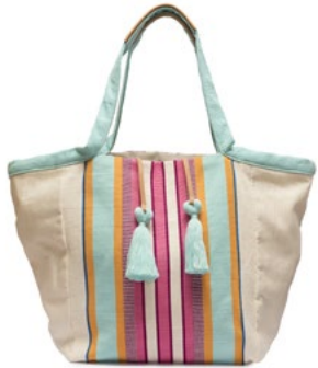
SS2245 | Rabano Wholesale: $54, MSRP: $118

13" H x 22" Top W x 12" Btm W x 6.5" D x 8.5" Strap Drop