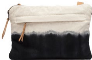
SS2227 | Black Hand Dye Wholesale: $49, MSRP: $108