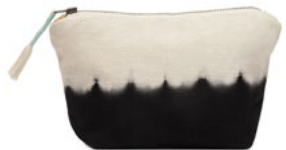
SS2207 | Black Hand Dye Wholesale: $17, MSRP: $38