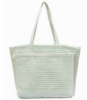
SS2255 | Hierba Buena Wholesale: $61, MSRP: $135