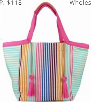
SS2247 | Moras Wholesale: $54, MSRP: $118