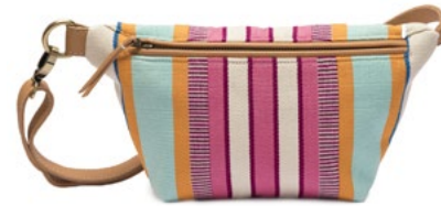
SS2231 | Rabano Wholesale: $49, MSRP: $108

The Cruza is our sling / belt bag that instantly elevates any look! It features a front and back zip pocket, and an adjustable leather strap so you can easily wear as a sling or around your waist. 6" H x 11" Top W x 6.25" Btm W x 15.5" Strap Drop