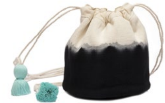
SS2239 | Black Hand Dye Wholesale: $26, MSRP: $58