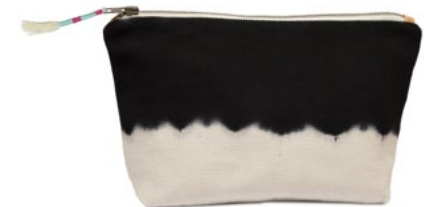
SS2211 | Black Hand Dye Wholesale: $22, MSRP: $48