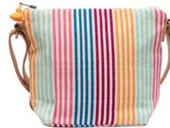
SS2260 | Moras Wholesale: $49, MSRP: $108

Our newest crossbody is the baby sister of our Lidia hobo bag. Available in three colorways, this gorgeous silhouette was constructed to stow all your essentials and bring a modern and refined look to an outfit. 9" H x 11.5" Top W x 7.5" Bttm W x 4" D x 21" Strap Drop