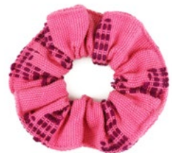
SS2278 | Pitaya Wholesale: $6, MSRP: $14

Top off your look with our Carmen Scrunchie and match it back to your favorite Mercado Global bag. 4" Diameter