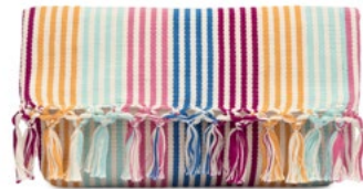
SS2220 | Moras Wholesale: $40, MSRP: $88