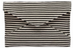
SS2225 | Black and Natural Stripe Wholesale: $26, MSRP: $58