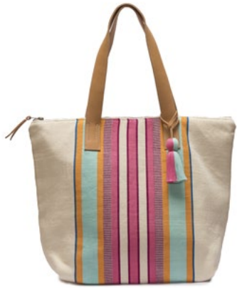
SS2249 | Rabano Wholesale: $63, MSRP: $138

The Angela, otherwise known as our commuter bag, is large enough to fit a laptop and small enough to comfortably carry around wherever your day takes you. Featuring three separate interior compartments, a zip closure, and durable leather handles, you'll stay stay organized with this classic everyday bag. 13.5" H x 17.5" Top W x 12.5" Btm W x 5" D x 9" Strap Drop