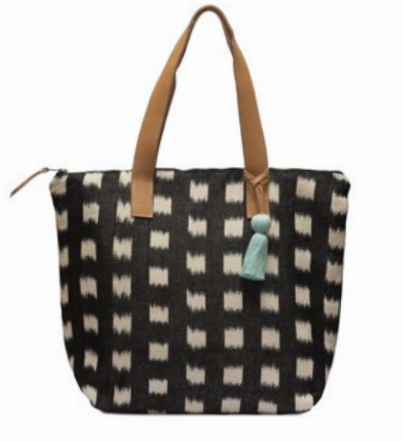
SS2251 | Black Window Pane Jaspe Wholesale: $63, MSRP: $138