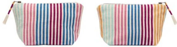
SS2204 | Moras Wholesale: $17, MSRP: $38

The Mini Cristina pairs with its full-size sister for a complete travel set, or tucks into totes as an organizer on its own. Yarn zip pull and water-resistant lining. 5" H x 8.5" Top W x 6" Btm W x 3" D