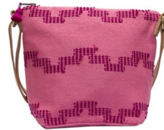
SS2261 | Pitaya Wholesale: $49, MSRP: $108