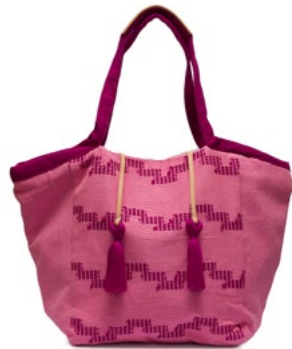
SS2246 | Pitaya Wholesale: $54, MSRP: $118