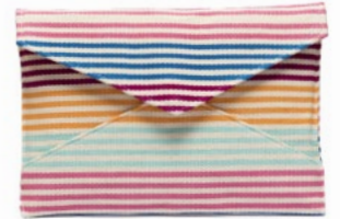
SS2223 | Moras Wholesale: $26, MSRP: $58