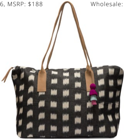
SS2268 | Black Window Pane Jaspe Wholesale: $86, MSRP: $188