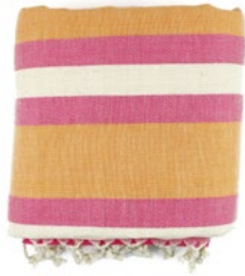
SS2286 | Pitaya Wholesale: $45, MSRP: $98