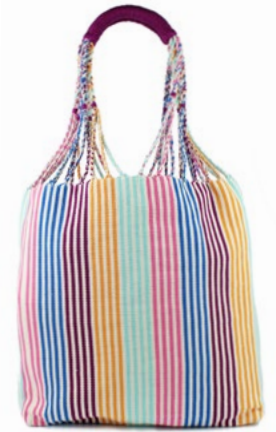
SS2243 | Moras Wholesale: $45, MSRP: $98