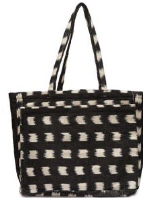
SS2256 | Black Window Pane Jaspe Wholesale: $61, MSRP: $135