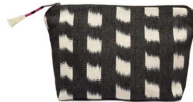
SS2210 | Black Window Pane Jaspe Wholesale: $22, MSRP: $48