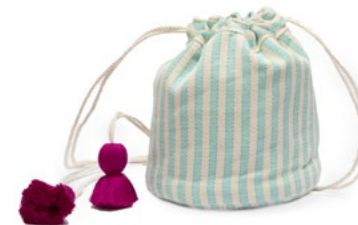
SS2237 | Hierba Buena Wholesale: $26, MSRP: $58