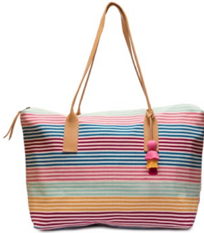
SS2267 | Moras Wholesale: $86, MSRP: $188