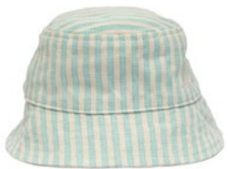
SS2282 | Hierba Buena Wholesale: $31, MSRP: $68

10" H x 6.75" Crown Diameter x 3.25" Brim D