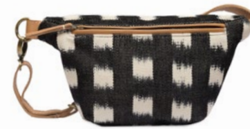
SS2201 | Black Window Pane Jaspe Wholesale: $49, MSRP: $108