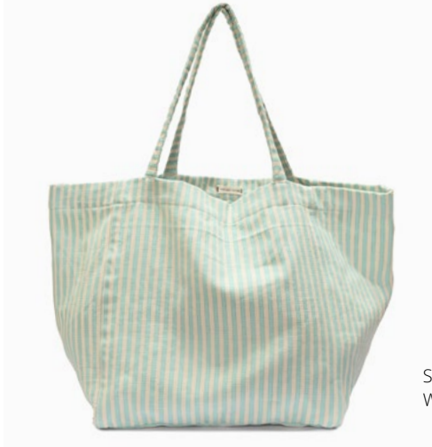
SS2240 | Hierba Buena Wholesale: $35, MSRP: $78

Oversized, foldable, and machine washable. Our stylish and spacious Blanca tote is unlined with durable felled seams. This soft and spacious carryall stows your goods for the beach or market, and folds neatly when not in use. Machine washable. 14" H x 24" Top W x 13" Bttm W x 10" D x 9.5" Strap Drop