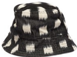
SS2283 | Black Window Pane Jaspe Wholesale: $31, MSRP: $68