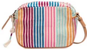
SS2228 | Moras Wholesale: $49, MSRP: $108

The Juana is a classic box crossbody for everyday wear. Top zipper, interior pocket, back slip pocket, adjustable strap, and leather detailing. 6" H x 8" W x 3" D x 18.5" Strap Drop