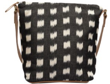
SS2259 | Black Window Pane Jaspe Wholesale: $68, MSRP: $148