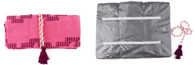
SS2213 | Pitaya Wholesale: $22, MSRP: $48