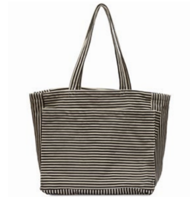
SS2257 | Black and Natural Stripe Wholesale: $61, MSRP: $135