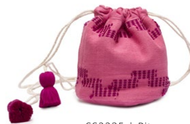
SS2235 | Pitaya Wholesale: $26, MSRP: $58