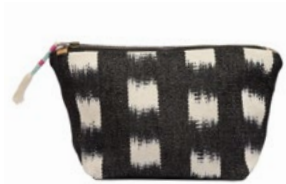
SS2206 | Black Window Pane Jaspe Wholesale: $17, MSRP: $38