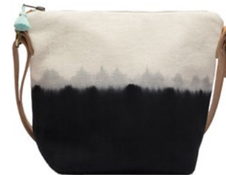
SS2262 | Black Hand Dye Wholesale: $49, MSRP: $108