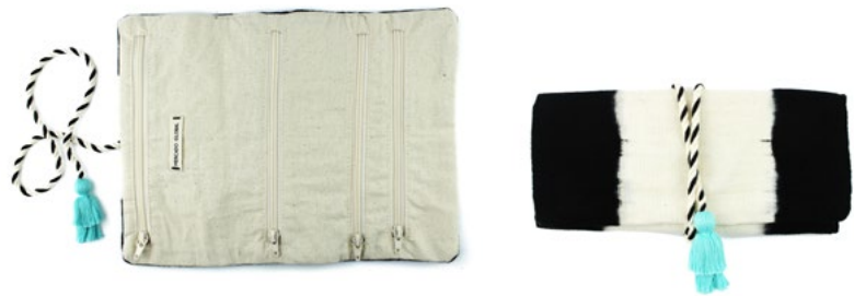
SS2216 | Black Hand Dye Wholesale: $26, MSRP: $58