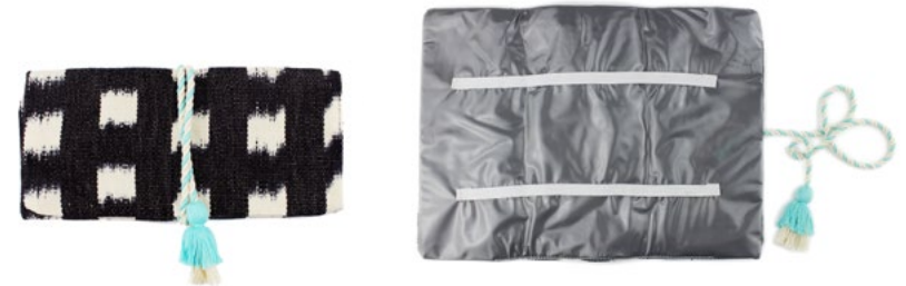
SS2214 | Black Window Pane Jaspe Wholesale: $22, MSRP: $48