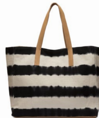
SS2253 | Black Hand Dye Wholesale: $67, MSRP: $148