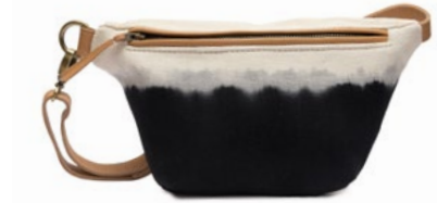
SS2202 | Black Hand Dye Wholesale: $49, MSRP: $108