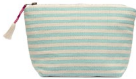
SS2205 | Hierba Buena Wholesale: $17, MSRP: $38