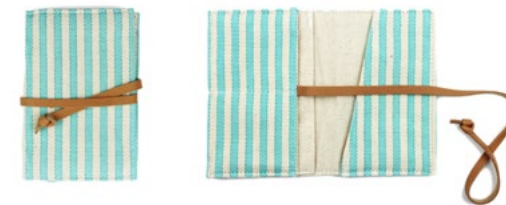
SS2273 | Hierba Buena Wholesale: $17, MSRP: $38