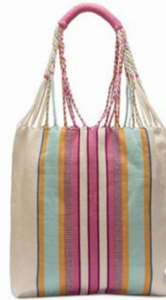
SS2242 | Rabano Wholesale: $45, MSRP: $98

14" H x 15" Top W x 13" Btm W x 10.5" Strap Drop