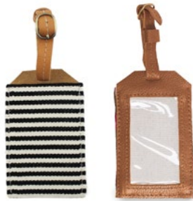
SS2270 | Black and Natural Stripe Wholesale: $11, MSRP: $24