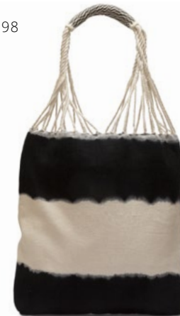
SS2244 | Black Hand-Dye Wholesale: $45, MSRP: $98