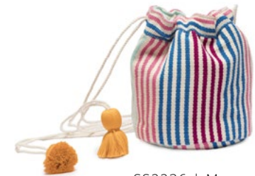
SS2236 | Moras Wholesale: $26, MSRP: $58