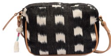
SS2230 | Black Window Pane Jasper Wholesale: $49, MSRP: $108