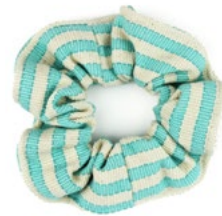
SS2280 | Hierba Buena Wholesale: $6, MSRP: $14