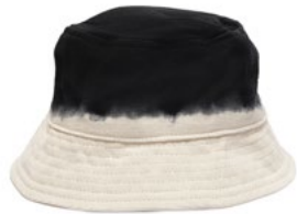
SS2284 | Black Hand Dye Wholesale: $31, MSRP: $68