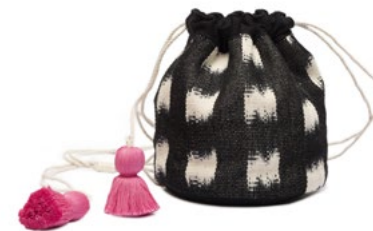
SS2238 | Black Window Pane Jaspe Wholesale: $26, MSRP: $58