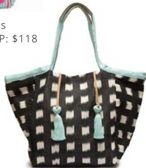
SS2203 | Black Window Pane Jaspe Wholesale: $54, MSRP: $118