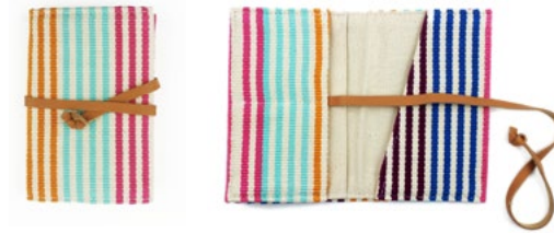
SS2272 | Moras Wholesale: $17, MSRP: $38