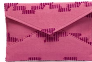
SS2222 | Pitaya Wholesale: $26, MSRP: $58