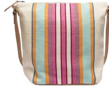
SS2258 | Rabano Wholesale: $68, MSRP: $148

Lidia Hobo, our classic mid-size shoulder bag. Updated with a zipper closure, and tassel detailing. 13" H x 10.25" W x 4.5" D x 19" Strap Drop