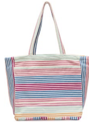
SS2254 | Moras Wholesale: $61, MSRP: $135

12.5" H x 14.75" W x 8.25" D x 11.5" Strap Drop