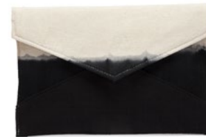
SS2224 | Black Hand Dye Wholesale: $26, MSRP: $58