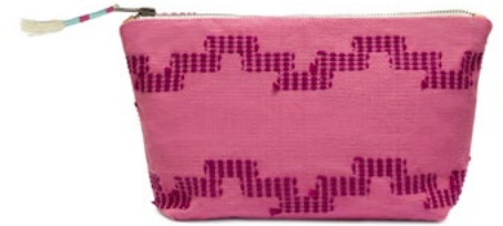
SS2209 | Pitaya Wholesale: $22, MSRP: $48