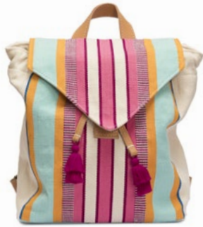
SS2264 | Rabano Wholesale: $63, MSRP: $138

The Angelica is the perfect go-to piece! It's all in the details with a drawstring closure topped with decorative tassels and adjustable leather straps. 11.75" H x 9.5" W x 5" D