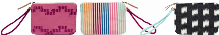
SS2217 | Pitaya / Moras Wholesale: $22, MSRP: $48