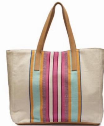
SS2252 | Rabano Wholesale: $67, MSRP: $148

Our Gladys Tote is a staff favorite! This large tote is the perfect blend of sophistication & fun. With leather straps and leather bottom, this durable piece is a great everyday option! 13" H x 10.25" W x 4.5" D x 8.5" Strap Drop