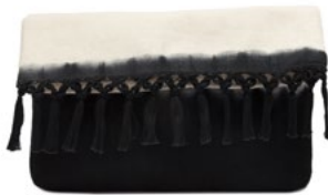
SS2221 | Black Hand Dye Wholesale: $40, MSRP: $88