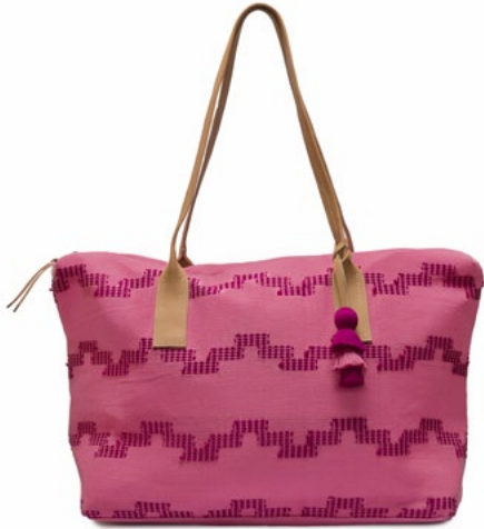
SS2266 | Pitaya Wholesale: $86, MSRP: $188

The Soledad Weekender is a lightweight and soft-bodied travel bag. Features top zipper, playful fringe pompom, interior zip and welt pockets. 14" H x 21" Top W x 17" Btm W x 8" D x 9.5" Strap Drop