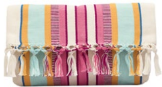
SS2219 | Rabano Wholesale: $40, MSRP: $88