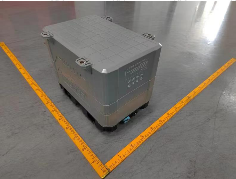
Figure 2 Overall view II of battery (外观图II)