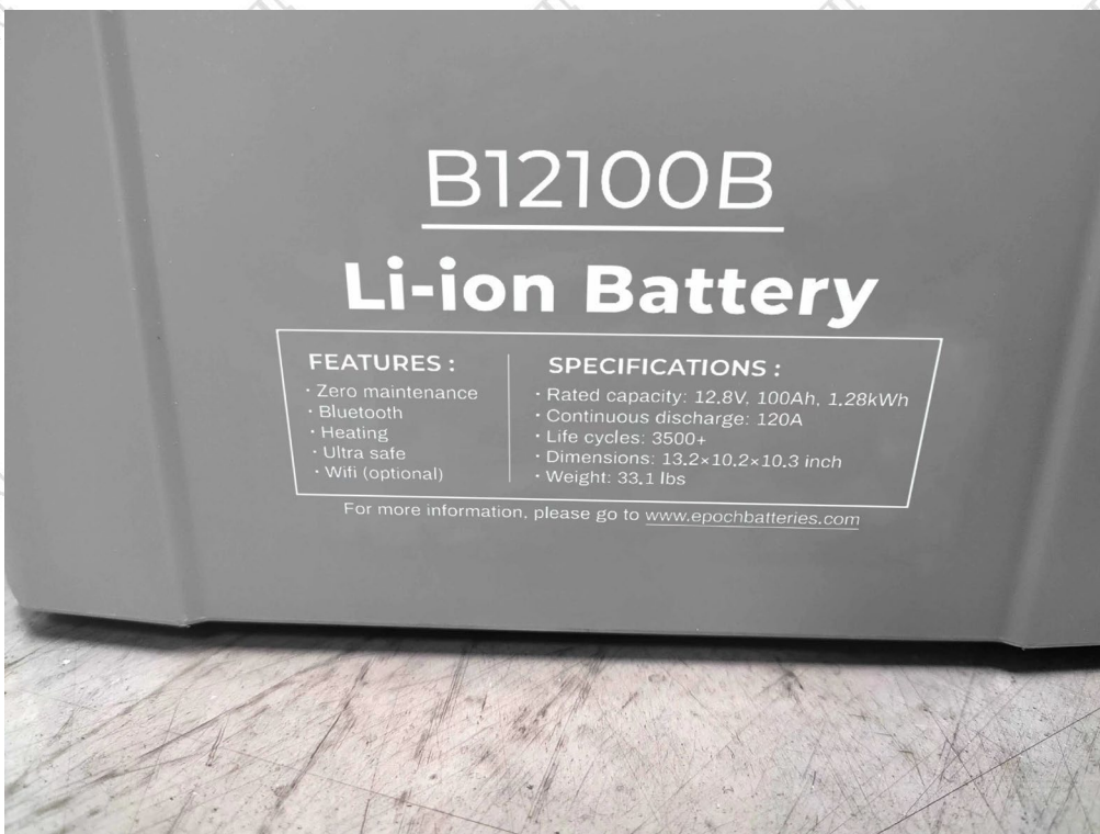
Figure 4 Battery Label (标签图)