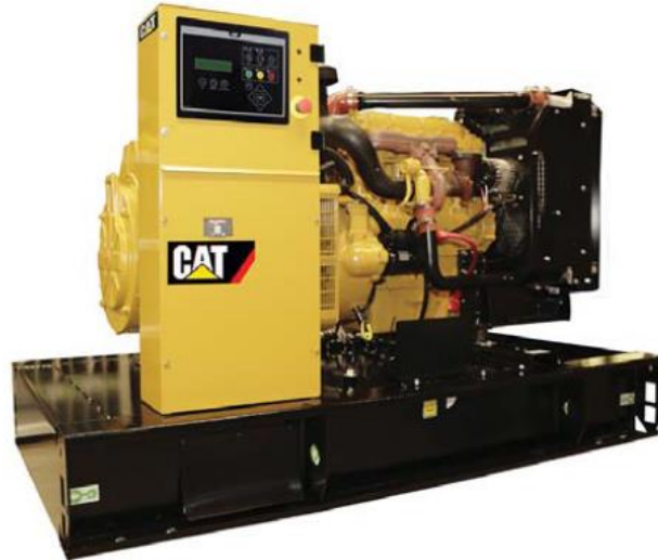
Image shown may not reflect actual package