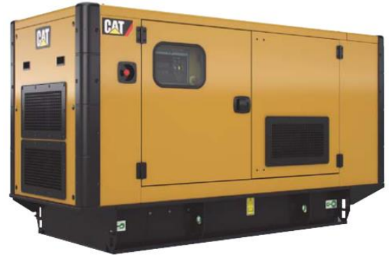
Enclosure pictured may include optional accessories