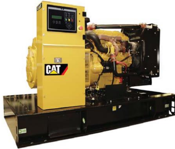
Image shown may not reflect actual package