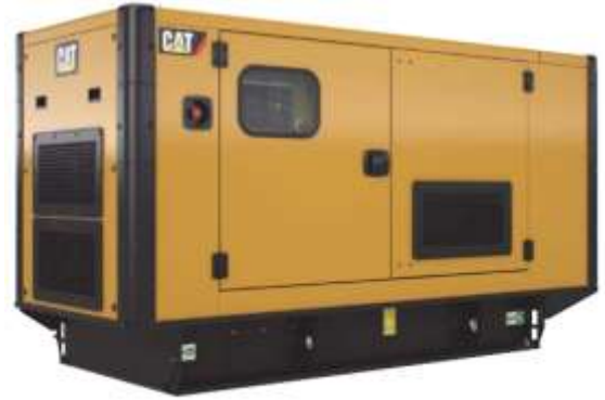
Enclosure pictured may include optional accessories