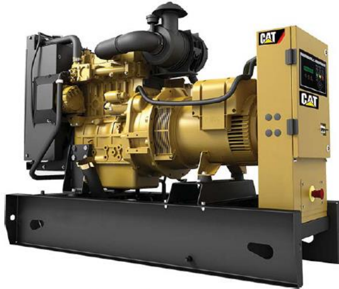
Image shown may not reflect actual package