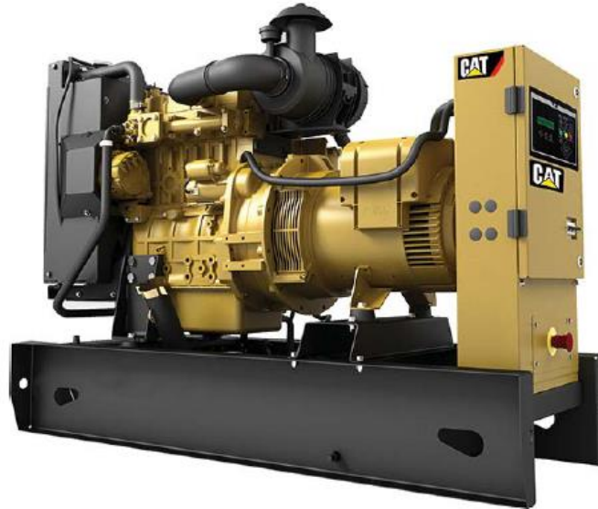
Image shown may not reflect actual package