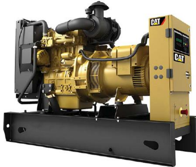
Image shown may not reflect actual package