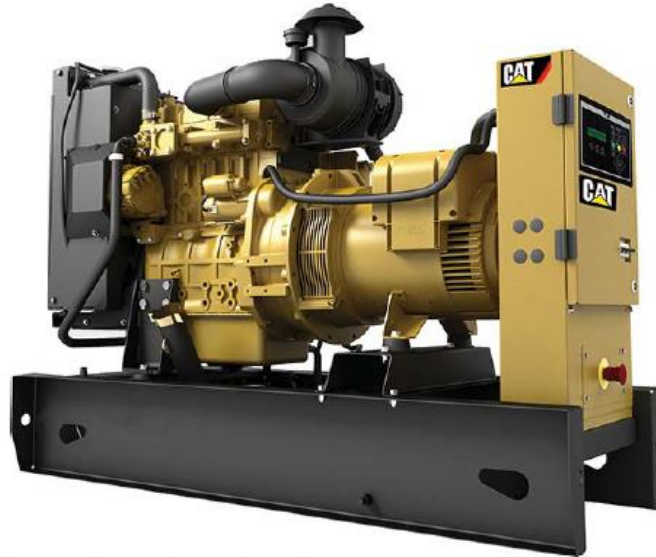
Image shown may not reflect actual package