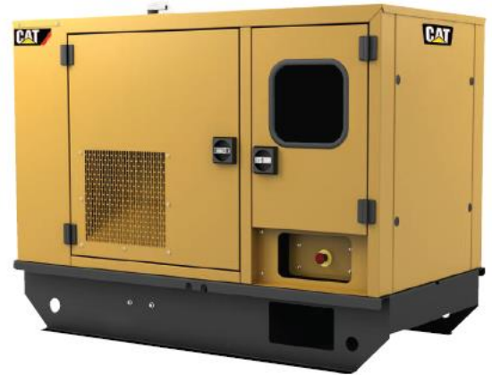
Enclosure pictured may include optional accessories