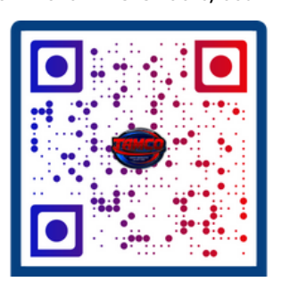
To contact us, scan QR code