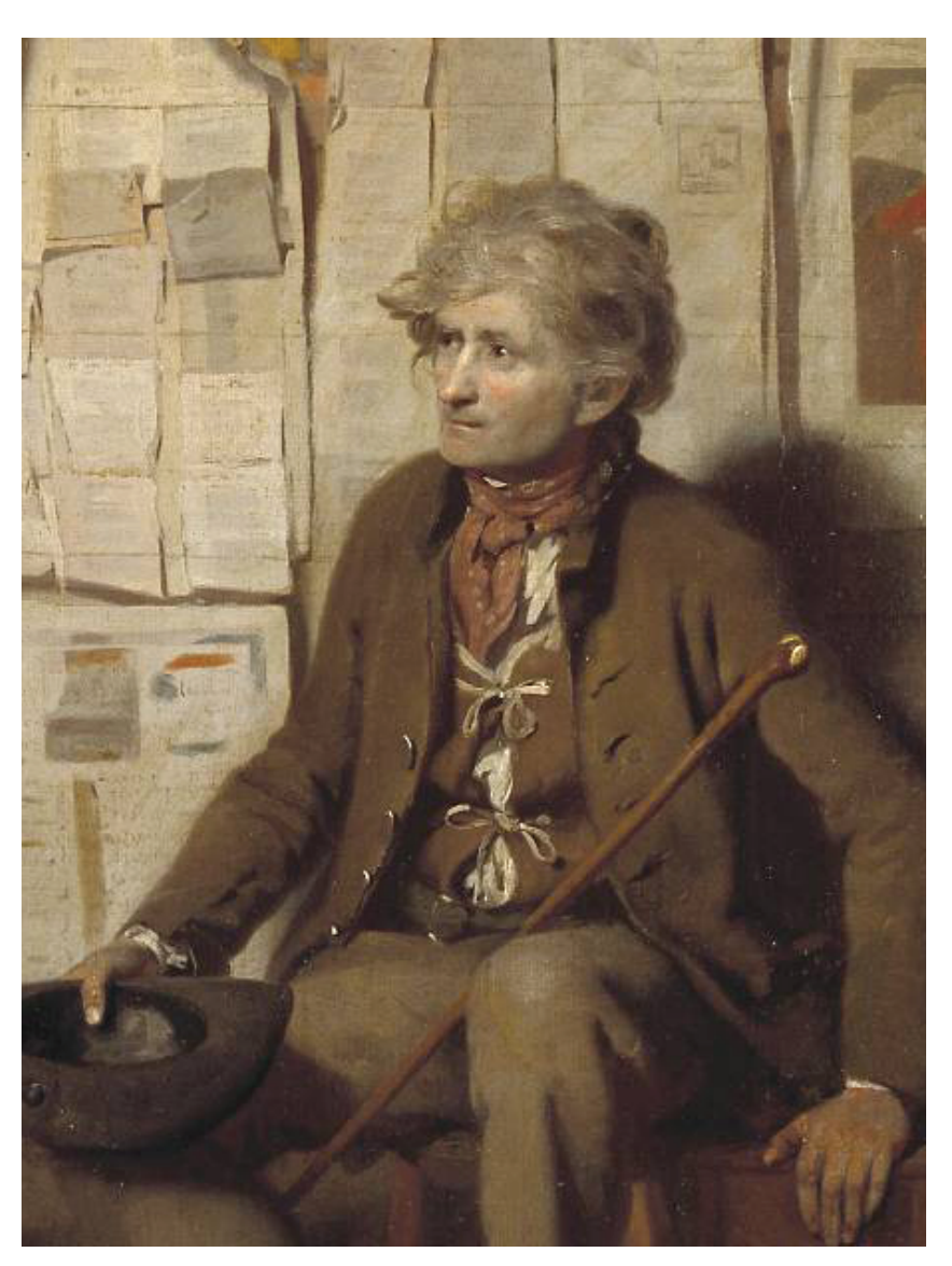
Extract from: A Girl Buying a Ballad, 1778 Henry Walton Reference - T07594, TATE