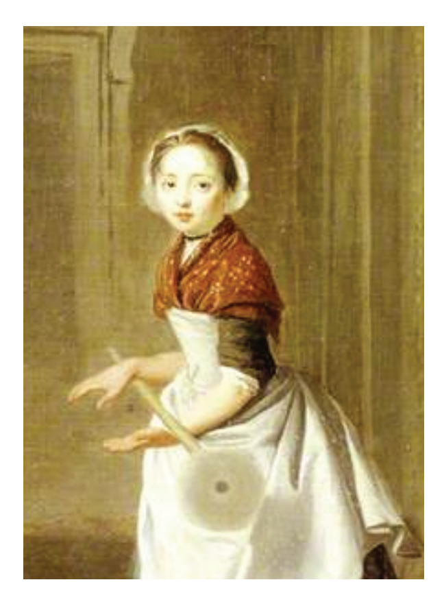
Extract from: A City Shower, 1764 Edward Penny Accession number - 88.126, Museum of London