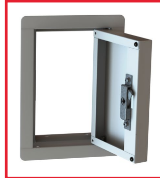
Z-Series metal access panel - Z2002