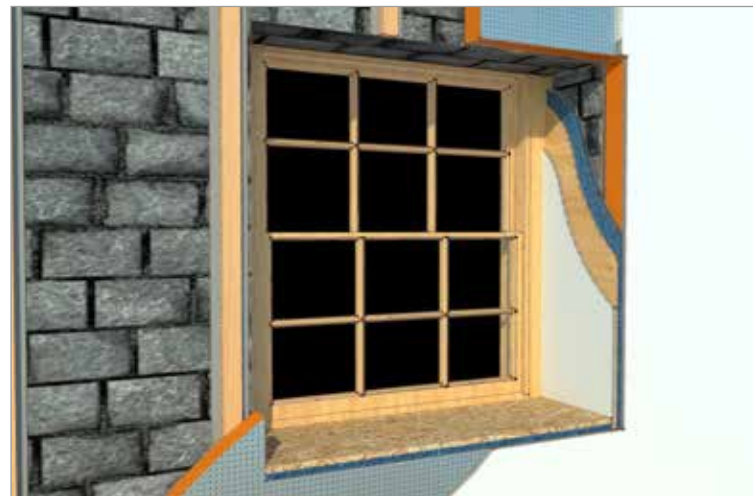
Image showing Spacetherm WRB applied internally to a reveal on an existing external wall structure.