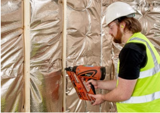
Prepare for plasterboard fixing

Prepare for plasterboard by fixing horizontal or vertical battens ((size in accordance with specification e.g. 25mm, 38mm, 50mm battens) nailing or screwing through Eolis HC to timber structure. Where joints between plasterboard sheets are unsupported, timber noggins should be installed.