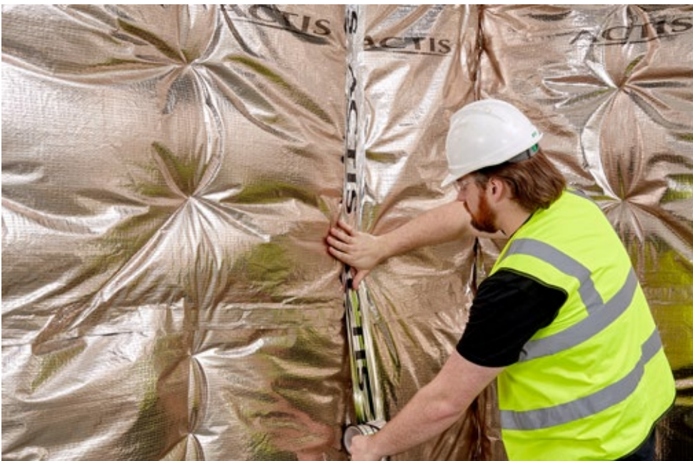
Seal with tape

All perimeter edges, including around windows and doors should be stapled every 50mm and secured with tape and battens.