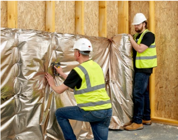
Install across timbers

Install Eolis HC across the face of timbers fixing in a continuous layer and taking care that the insulation thickness is maintained between fixing points. Staple to timbers every 250mm, using min. 14mm galvanised staples.