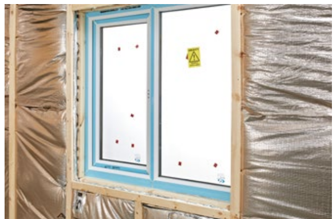
Secure with batten

For further advice from ACTIS call the technical department on 01249 462 888 or email solutions@insulation-actis.com