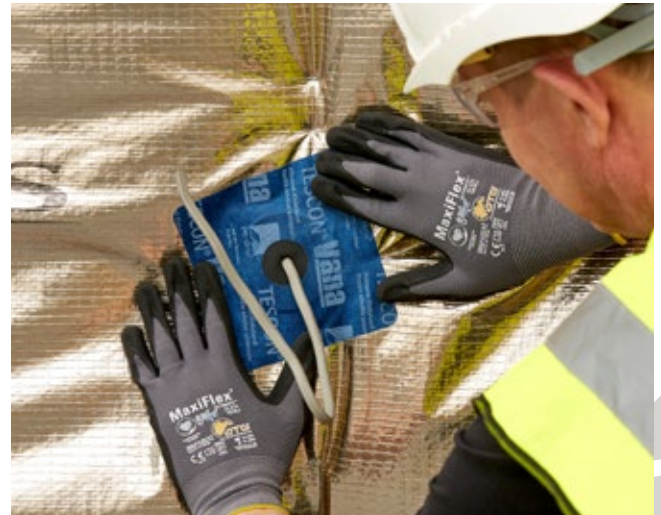
Fix grommet around electric wiring