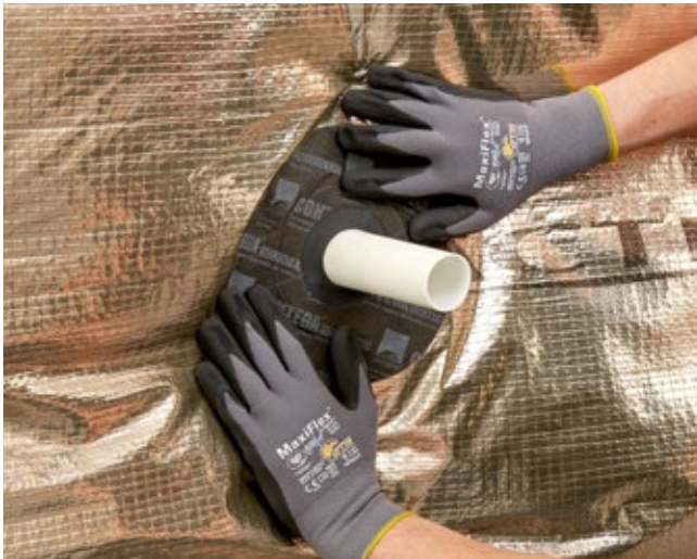
Fix grommet around pipes and ducting

For further information please contact ACTIS Technical Department.