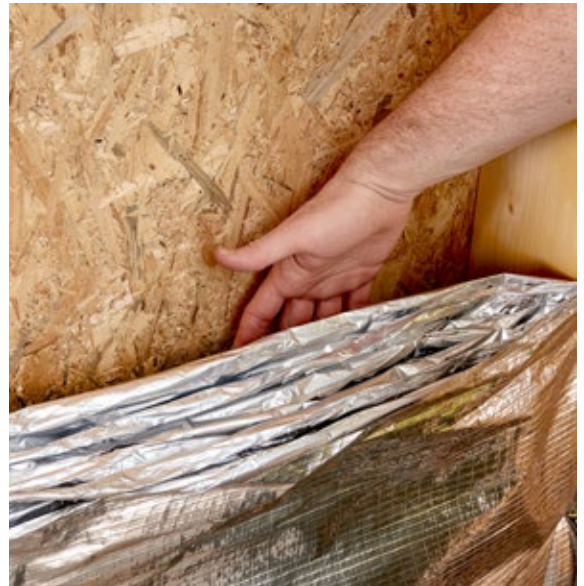
Maintain an air gap where required