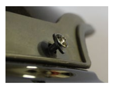
Ensure the washers on each mounting screw are out toward the head of the screws