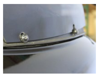
Install your new Flare™ Windshield onto the mounting screws. Torque the two center screws first, then the two outer screws.