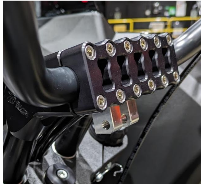
101-0336 Relocation Bracket, Bottom Mounting Option