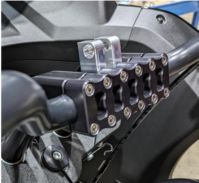
101-0336 Relocation Bracket, Top Mounting Option

Relocation Bracket is fully adjustable at installation to allow rider to position gauge at different angle and heights. Examples of mounting can be seen in pictures below. Digital Gauge Relocation Housing, TC Bros Part #101-0344, show for for reference, not included in this kit.