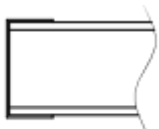
Folded Steel/Al Cap

The leaf edges listed below are available for the PS60 door set