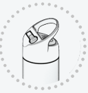
25 Oz / 740ml

Depending on your usage, you can purchase PureMax bottle-only products from WAATR.COM in various sizes. PureMax cap currently fits 25, 32, and 40 oz PureMax bottles. Note: WAATR will be introducing more bottle size options in the future.