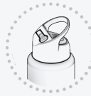
40 Oz / 1180ml

We know filters are not "one size fits all". So, we designed the cartridge to be easily interchangeable to accommodate a variety of cartridges that we will be introducing in the near future.