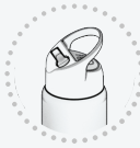
32 Oz / 940ml