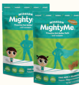
Proactive Nut Butter Puff