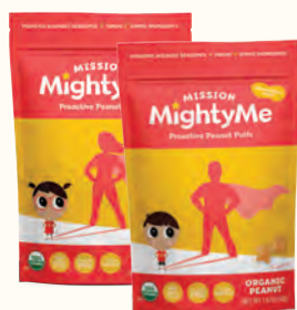
Proactive Peanut Puff

Try our Proactive Peanut Puffs and our new Proactive Nut Butter Puffs with Peanuts and Tree Nuts to regularly include nuts in your little one's diet. And stay tuned for more yummy products containing other diverse foods!