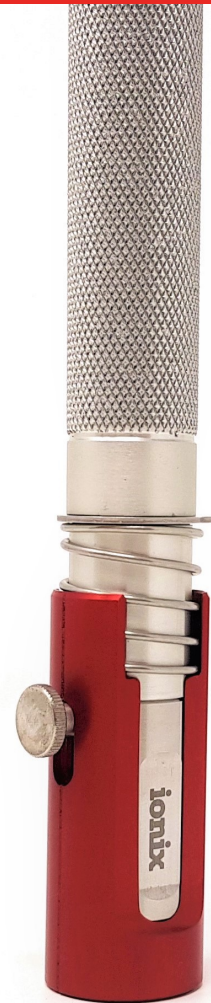
Couplant protector and handle