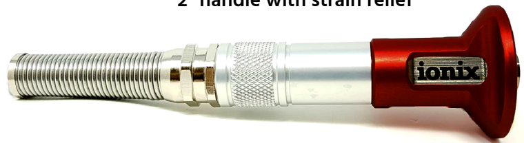
2" handle with strain relief