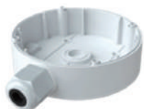
Junction Box: JB0207