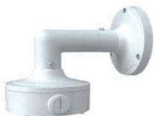
Wall Mount Bracket: JB0207 + WM0407

Terms & Conditions 使用細則 Design and specifications are subject to change without prior notice. Copyright © 2019 Signal Communications Limited. TeleEye is a trademark of Signal Communications Limited and is registered in China, European Community, Hong Kong, U.S. and other countries. All other trademarks are the property of their respective owners.