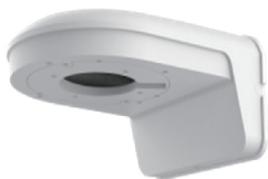
Wall Mount Bracket: WM0203

Terms & Conditions 使用細則 Design and specifications are subject to change without prior notice. Copyright © 2019 Signal Communications Limited. TeleEye is a trademark of Signal Communications Limited and is registered in China, European Community, Hong Kong, U.S. and other countries. All other trademarks are the property of their respective owners.