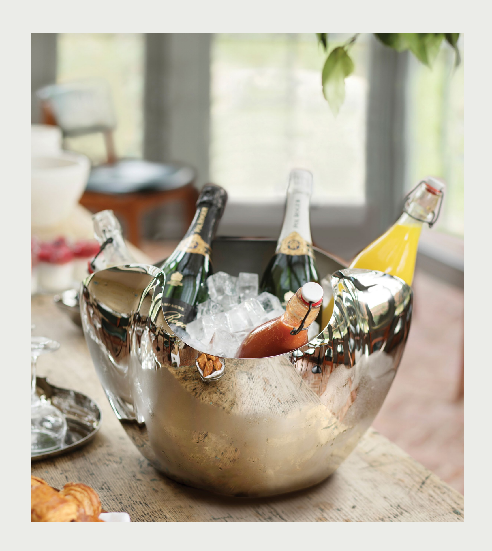
Drift Champagne Cooler Grand £250.00