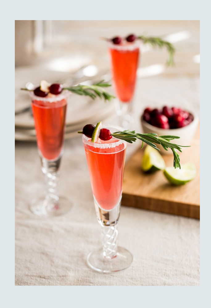
Airtwist Champagne Glass Sets from £44.00 Malvern Cutlery Sets from £90.00 Drift Tea Collection