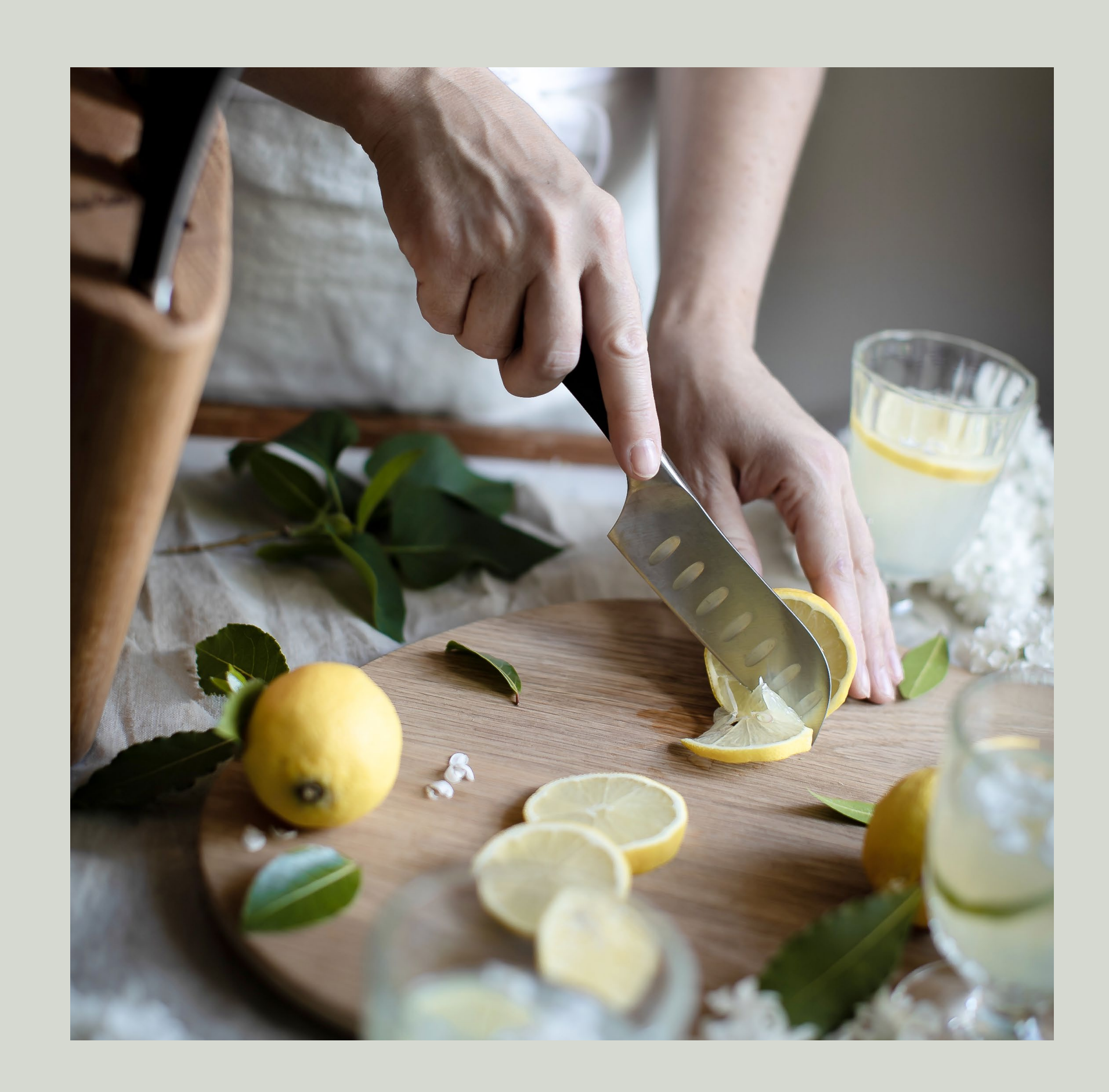
Signature Knives and Oak Pebble Boards created for today's home cooks like us Santoku Knife I I cm £42.00 Oak Pebble Board 44cm