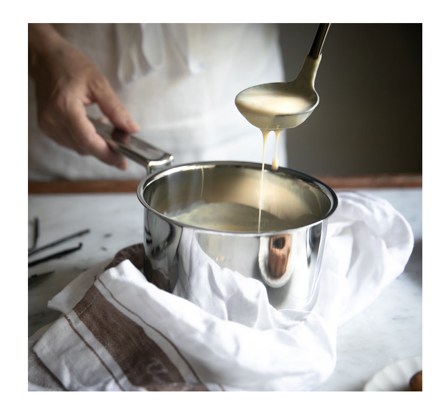
The kitchen is now the restaurant Campden Cookware 2.2L Saucepan £64.00 Signature Storage Jars from £16.00