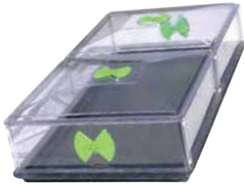
Large Vitopod (1m long)