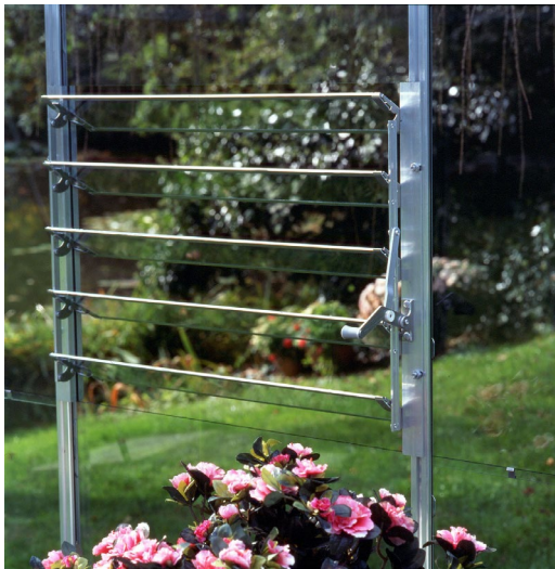
View from inside