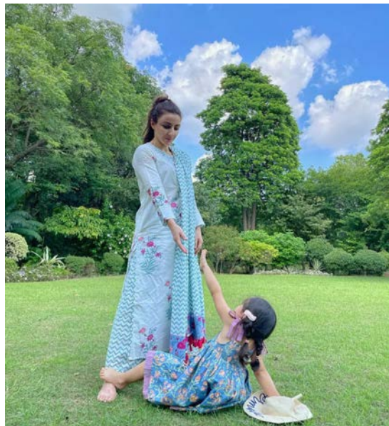
Soha Ali Khan enjoys a summer day with daughter Inaaya Naumi Kemmu

Wearing a dab of nude pink lipstick, Soha amplified the glam quotient with a dewy makeup look that included rosy blushed cheeks, kohl-lined eyes with black eyeliner streaks and filled-in eyebrows. She captioned the pictures, “Three generations of women! (and a dog)” and “Summer” sic.