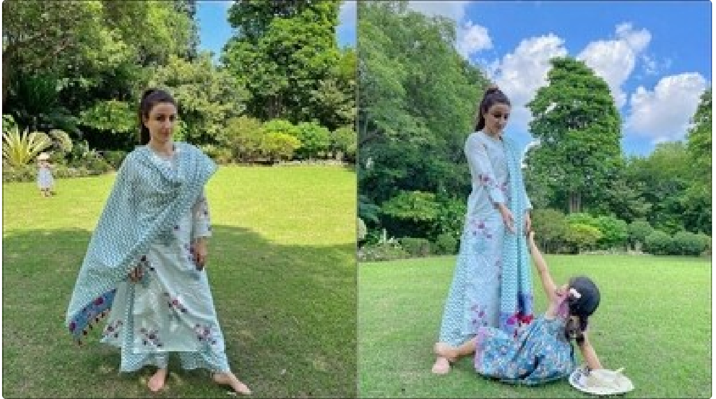
Soha Ali Khan's floral cheer in ₹5k A-line kurta, palazzo aces ultra glam

Palazzos are proof that ethnic fashion isn't boring and Soha Ali Khan's latest sartorial pictures in a ₹5k floral A-line kurta, palazzo set with dupatta are proof