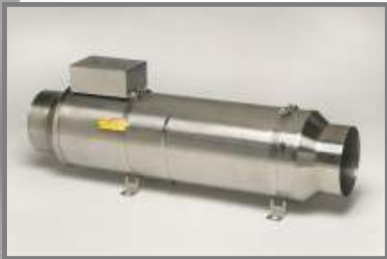
Shown with optional inlet & exhaust fittings