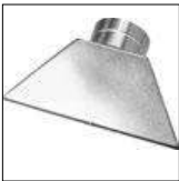
Item No. 4023 Wide slot nozzle 200 x 5 mm, for model 7500