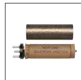
Item No. 4011 Insulating tube Item No. 2000 Heating element 630 W Item No. 2004 Heating element 900 W Item No. 2007 Heating element 1500 W