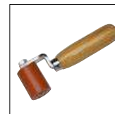
Item No. 7001 Pressure roller one- armed, 45 mm