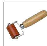
Item No. 7000 Pressure roller two- armed, 45 mm