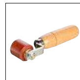
Item No. 6994 Pressure roller 1-armed, 28 mm bearing mounted