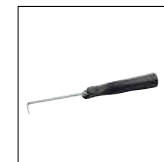
Item No. 7014 Seam tester