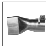
Item No. 4003 Nozzle, 40 mm flat