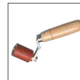
Item No. 7006 Pressure roller one- armed, 45 mm, 45° offset (patented)