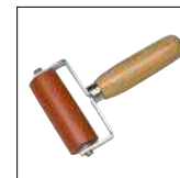
Item No. 7002 Pressure roller two- armed, 80 mm