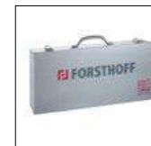
Item No. 7012 Metal case