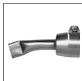
Item No. 4002 Nozzle, 20 mm flat