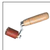
Item No. 7006 Pressure roller one- armed, 45 mm, 45° offset (patented)