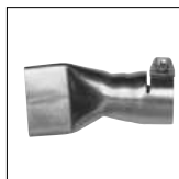
Item No. 4003 Nozzle, 40 mm flat