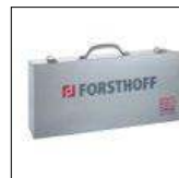
Item No. 7012 Metal case