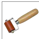
Item No. 7000 Pressure roller two- armed, 45 mm