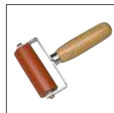
Item No. 7002 Pressure roller two- armed, 80 mm