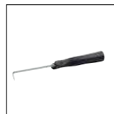
Item No. 7014 Seam tester