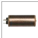
Item No. 3064 Heating element 3000 W, 230 V for HOT-AIR S