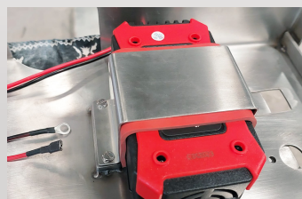
Built in charger