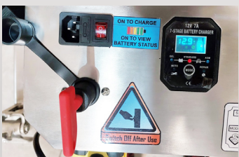
Charger and display