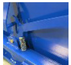
Spring Loaded (pull-down) Lever System