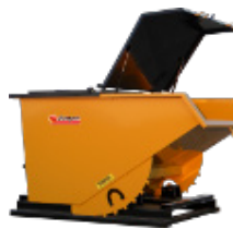
Custom Designed Lids