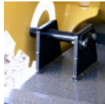
Removable Pin System