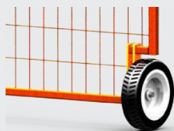
6' x 10' Equipment Gate