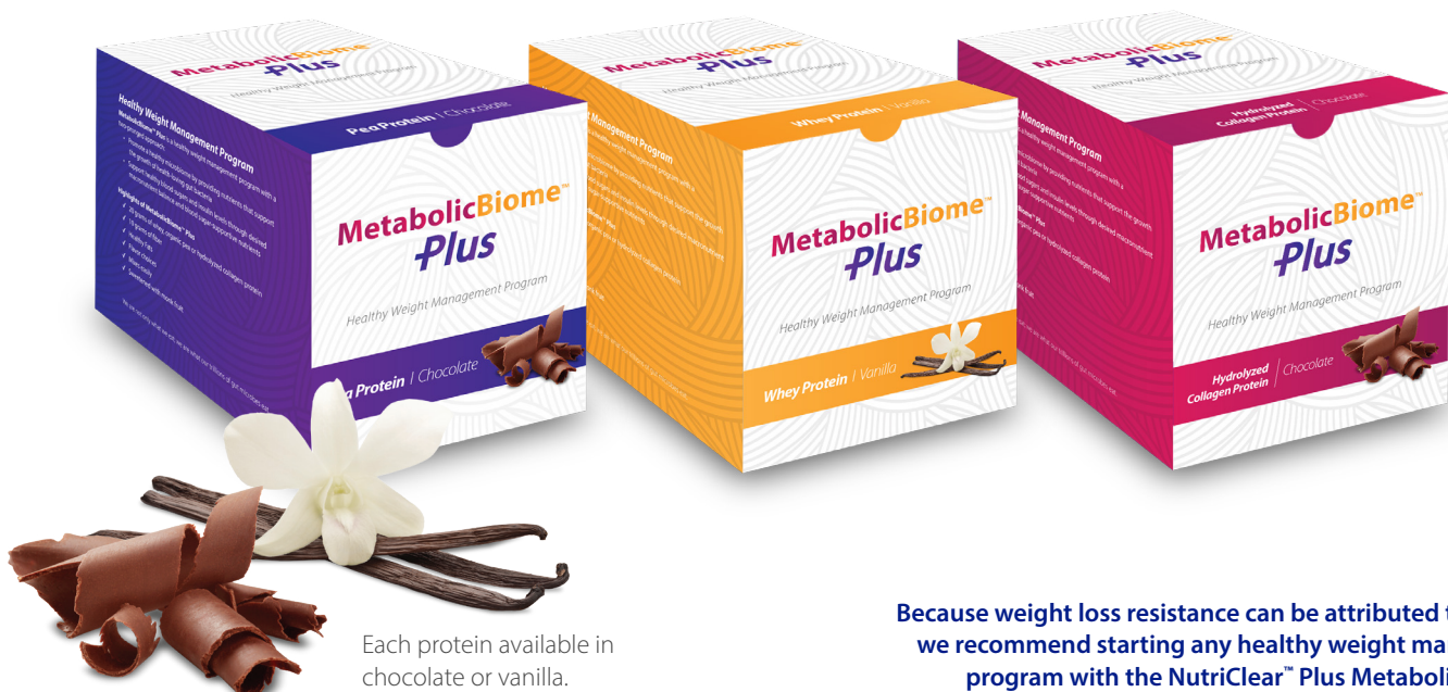
Each protein available in chocolate or vanilla.

Because weight loss resistance can be attributed to toxicity, we recommend starting any healthy weight management program with the NutriClear™ Plus Metabolic Cleanse.