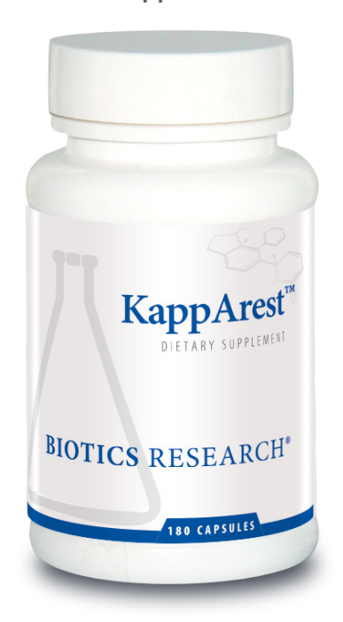
KappArest™ is available in a 180-count bottle (#7855).

Oftentimes, the mechanisms underlying disease processes are a result of a chronic inflammatory state. Much damage can occur when there is an uncontrolled host inflammatory response. KappArest™ provides the effective blend of nutrients proven to downregulate inflammatory pathways, primarily through the inhibition of NF-kappaB.