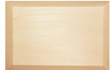
11"x 15"x 1.25" FIXED SIDED LARGE TRAY sku TG-DE-IX5 Qty: 100