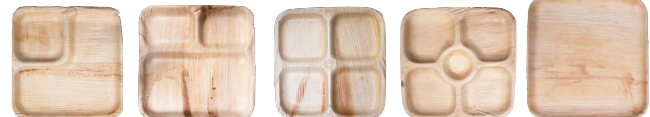
9" x 9" TWO COMPARTMENT PLATE sku 02-25-02C Qty: 300 9" x 9" THREE COMPARTMENT PLATE sku 02-25-03C Qty: 250 9" x 9" FOUR COMPARTMENT PLATE sku 02-25-04C Qty: 300 9" x 9" FIVE COMPARTMENT PLATE sku 02-25-05C Qty: 300 10" x 10" PLATE sku 01-20-25C Qty: 300