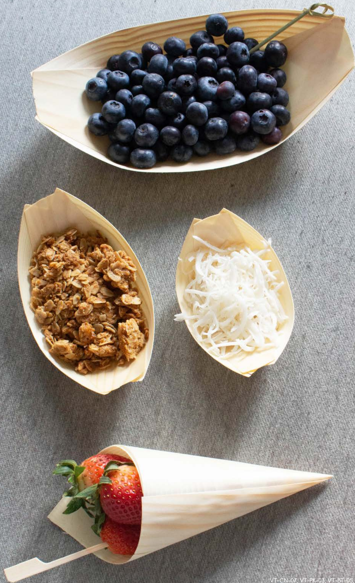
VT-CN-07, VT-PK-03, VT-BT-05, VT-BT-06, VT-BT-08, VT-SK-03