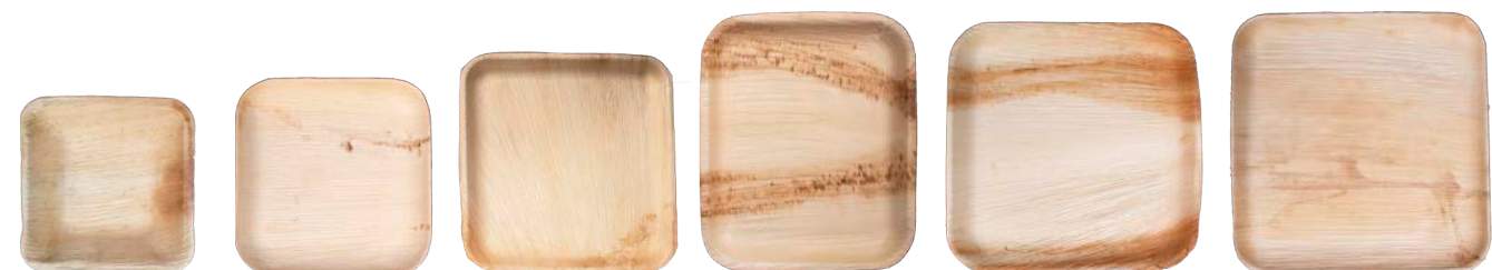
5" x 5" PLATE sku 01-22-13B Qty: 300 6" x 6" PLATE sku 01-22-15B Qty: 300 7" x 7" PLATE sku 01-00-16B Qty: 300 7" x 8.5" PLATE sku 01-22-22B Qty: 300 8" x 8" PLATE sku 01-20-20B Qty: 300 9" x 9" PLATE sku 01-20-25B Qty: 300