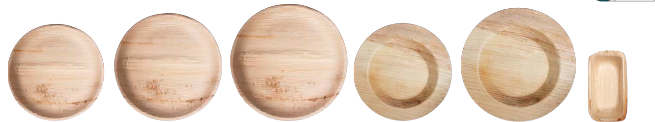
7" ROUND PLATE sku 01-01-20B Qty: 300 8" ROUND PLATE sku 01-01-22B Qty: 300 10" ROUND PLATE sku 01-01-25B Qty: 300 6" ROUND LIP PLATE sku 01-33-15B Qty: 300 9" ROUND LIP PLATE sku 01-33-25B Qty: 300 2"x 4" MINI TRAY sku 01-22-05B Qty: 600