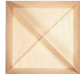
12"x 12"x 4" DEEP 10LB-FIX SIDED VESSEL WITH DIAGONAL PARTITION sku TG-DE-I2D Qty: 50