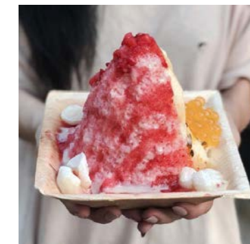
6" DEEP PYRAMID BOWL