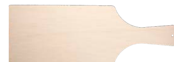
5" x 10" BOARD sku CB-RC-5X1 Qty: 100