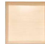
5"x 5" SQUARE sku TG-SE-5X5 Qty: 300