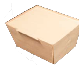
3" X 4" PETITE TO-GO-BOX sku TG-LB-3X4 Qty: 300

The Click N Lock are two piece double walled boxes. They are extremely durable, stackable, and leak resistant. Ideal for saucy foods.