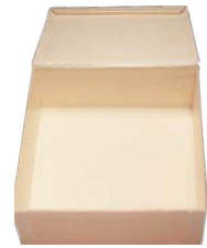
6" x 6" SMALL SQUARE sku TG-CB-6X6 Qty: 300