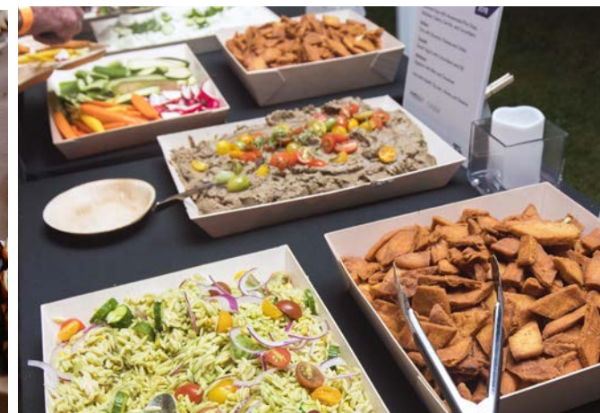
sku TG-DE-I2S, TG-CS-5X1