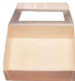
6" x 8" MEDIUM RECTANGLE W/ WINDOW LID sku WB-CB-6X8 Qty: 50