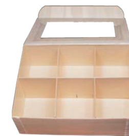
6" x 8" MEDIUM VENTO™ BOX W/ WINDOW LID sku WB-BB-6X8 Qty: 50