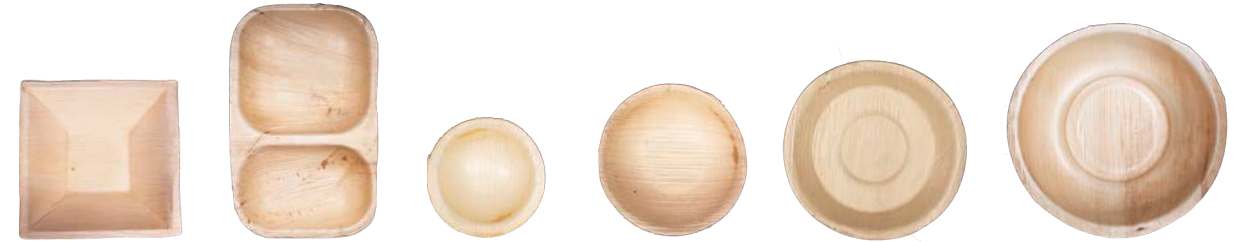
PYRAMID BOWL sku 02-22-6PY Qty: 300 6" x 11" TWO COMPARTMENT BOWL sku 01-00-13P Qty: 300 2.5" ROUND BOWL sku 01-01-02B Qty: 600 3.5" ROUND BOWL sku 01-01-10B Qty: 600 5" ROUND BOWL sku 01-00-5DR Qty: 300 8" x 8" SALAD BOWL sku 01-00-22B Qty: 300