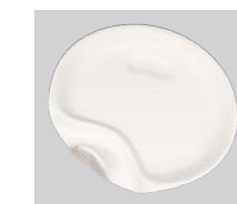
6" WINE GLASS HOLD-A-PLATE™ sku HP-EP-P6 Qty: 600

Hold a wine glass/beverage while also holding an appetizer. Free up a hand with our wine glass plate!