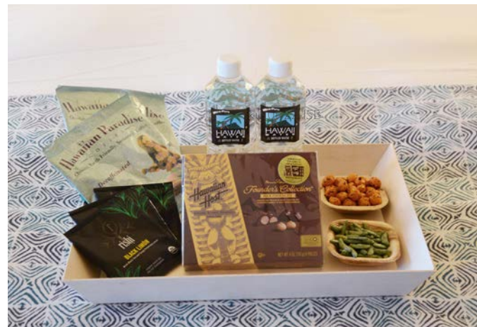
sku TG-DE-IX5, 01-01-I1B