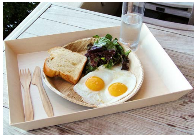
sku TG-DE-IX5, 01-01-25B, VT-2420, VT-2419