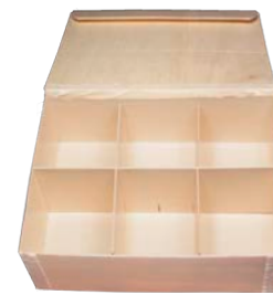
6" x 8" MEDIUM VENTO™ BOX sku TG-BB-6X8 Qty: 50

The Vento™ series adds a new dimension to the patented collapsible box with changeable bento inserts. Included in each set are click in dividers to create six different bento/compartmented boxes: single compartment or split 2,3,4,6, or 8 compartment box.