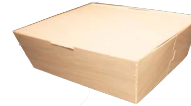
7" X 9" MEDIUM TO-GO-BOX sku TG-LB-7X9 Qty: 100