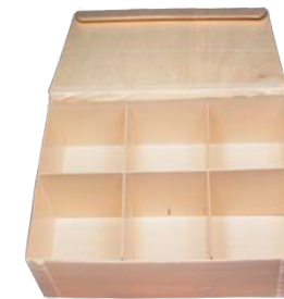
8" x 11" LARGE VENTO™ BOX sku TG-BB-8XI Qty: 50