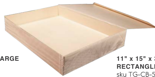
11" x 15" x 3" X-LARGE RECTANGLE sku TG-CB-5XI Qty: 50