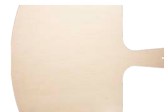
11"x 11" BOARD sku CB-SQ-1X1 Qty: 50