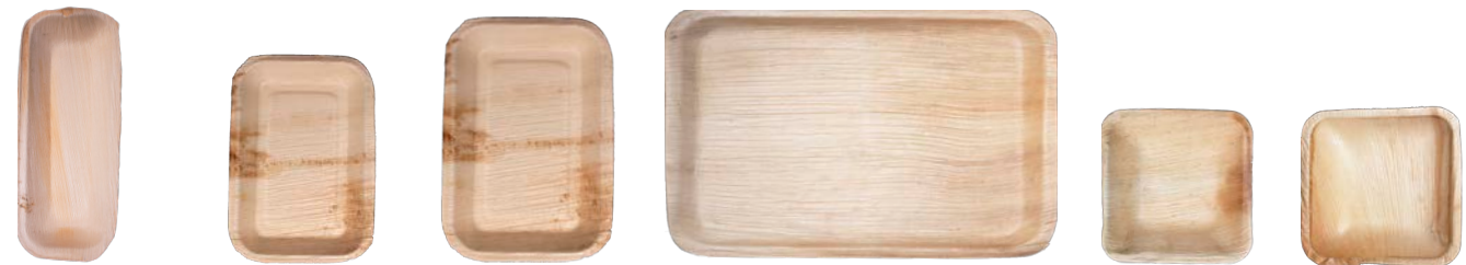
4"x 10" TRAY sku 01-22-18B Qty: 300 4.5" x 6" TRAY sku 01-22-12B Qty: 300 6" x 9" TRAY sku 01-22-6X9 Qty: 300 10" x 15.5" TRAY sku 01-00-40T Qty: 50 4" x 4" PLATE sku 01-22-10B Qty: 600 4" x 4" DEEP PLATE sku 01-22-10D Qty: 600