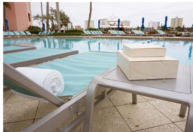
sku TG-CB-7X7, TG-CB-8XI