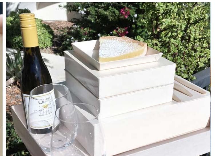
sku TG-CB-7X7, TG-CB-5XI