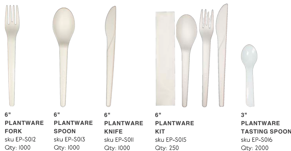
6" PLANTWARE FORK sku EP-S012 Qty: 1000 6" PLANTWARE SPOON sku EP-S013 Qty: 1000 6" PLANTWARE KNIFE sku EP-S011 Qty: 1000 6" PLANTWARE KIT sku EP-S015 Qty: 250 3" PLANTWARE TASTING SPOON sku EP-S016 Qty: 2000

Made from 100% renewable resources and PLA, A plant-based plastic, Plantware Cutlery is completely compostable, renewable, and heat resistant. All items meet ASTM standards for compostability. Their crystallized formulation adds strength and heat tolerance of 200 Degrees F.