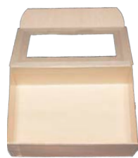
4" x 6" SMALL RECTANGLE W/ WINDOW LID sku WB-CB-4X6 Qty: 300