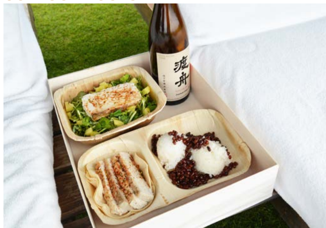
sku 01-00-I3P, 01-00-I5B, TG-CS-5X1