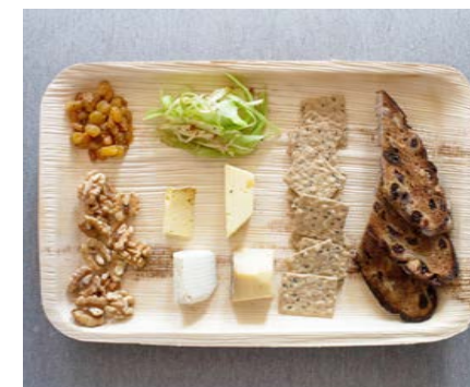
10"x15" PALM TRAY