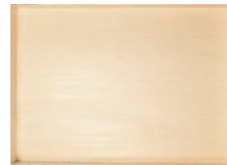
11"x 15"x 2" LARGE COLLAPSIBLE TRAY sku TG-CS-IX5 Qty: 100