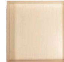
7"x 7" SQUARE sku TG-DE-7X7 Qty: 300