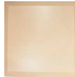
12"x 12"x 1" FIX SIDED TRAY sku TG-DE-I2S Qty: 100