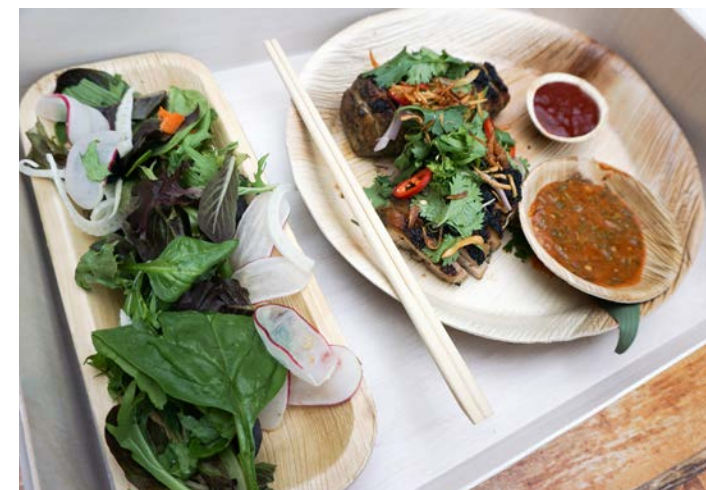
sku 01-22-18B, 01-01-25B, 01-01-10B, 01-01-02B