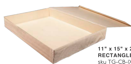
11" x 15" x 2" X- LARGE RECTANGLE sku TG-CB-IX5 Qty: 50