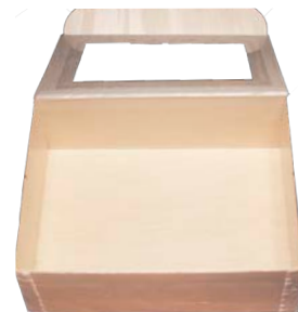
8" x 11" LARGE RECTANGLE W/ WINDOW LID sku WB-CB-8XI Qty: 50