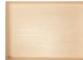
11"x 15"x 3" DEEP LARGE COLLAPSIBLE TRAY sku TG-CS-5XI Qty: 100