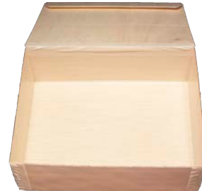
8" x 11" LARGE RECTANGLE sku TG-CB-8XI Qty: 100