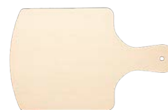
5"x 5" BOARD sku CB-SQ-5X5 Qty: 200