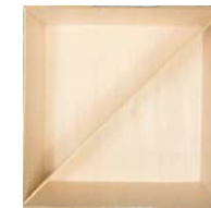
7"x 7" x 4" DEEP 3LB FIX SIDED VESSEL W/ PARTITION sku TG-DE-07D Qty: 50