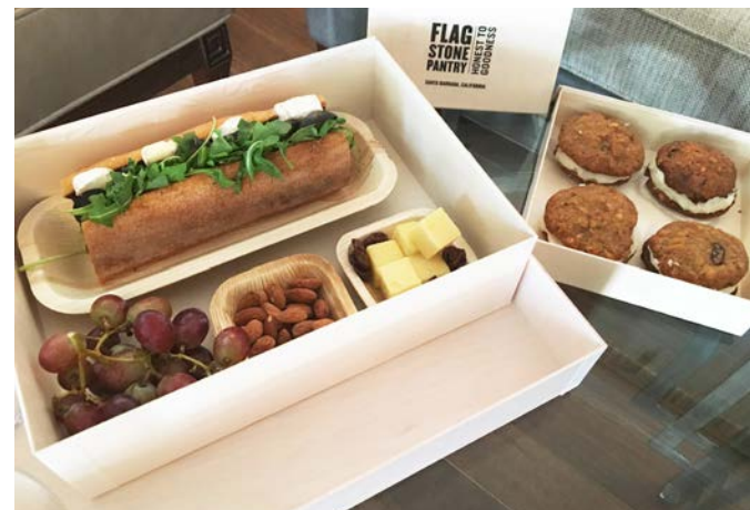
sku TG-CB-8XI, TG-CS-IX5, 01-22-I8B, 01-01-I1B, TG-DE-7X7