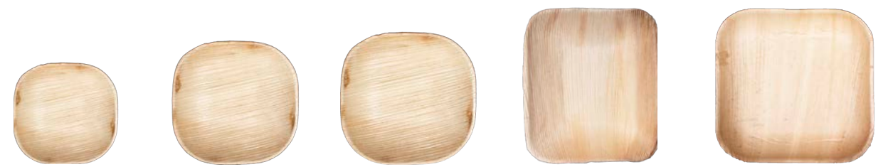
3" x 3" BOWL sku 01-01-11B Qty: 600 5" x 5" BOWL sku 01-00-18B Qty: 300 6" x 6" BOWL sku 01-00-13B Qty: 300 6 x 8" BOWL sku 01-00-15B Qty: 200 8" x 8" BOWL sku 01-00-20B Qty: 300