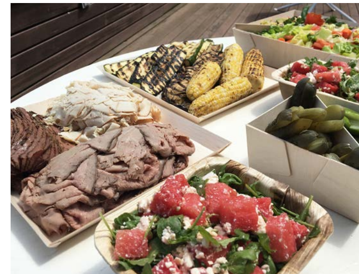
sku TG-DE-I2D, TG-DE-I2S