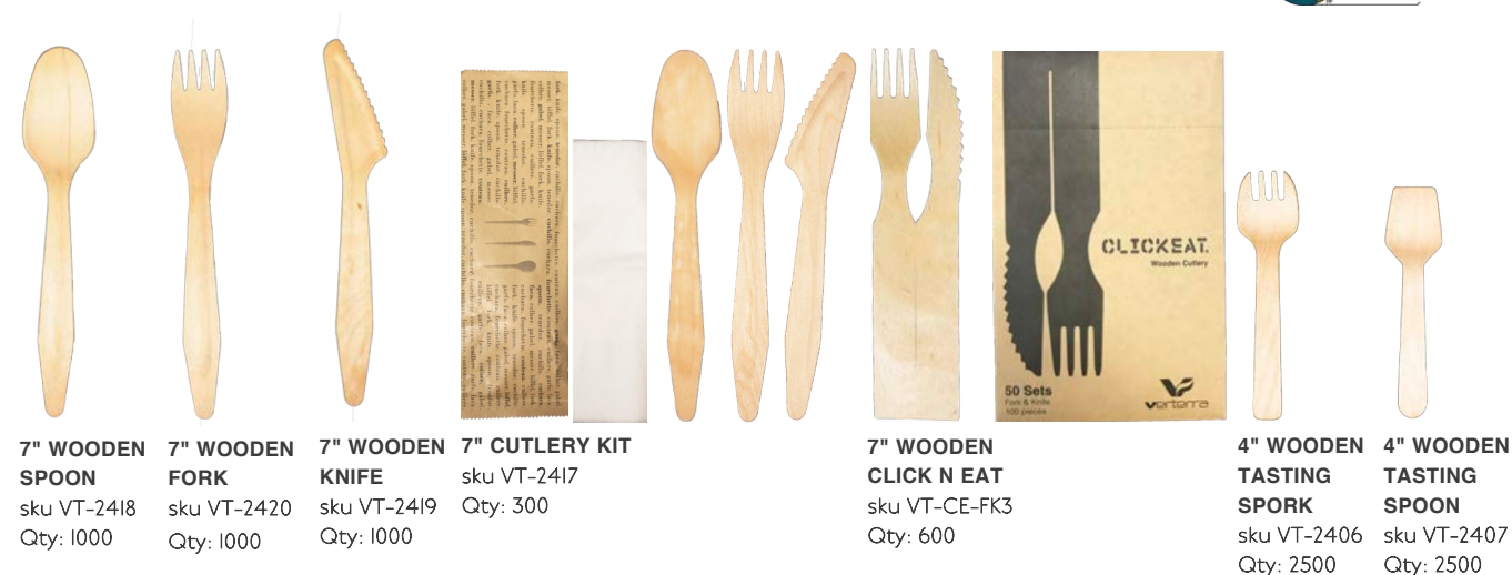
7" WOODEN SPOON sku VT-2418 Qty: 1000 7" WOODEN FORK sku VT-2420 Qty: 1000 7" WOODEN KNIFE sku VT-2419 Qty: 1000 7" CUTLERY KIT sku VT-2417 Qty: 300 7" WOODEN CLICK N EAT sku VT-CE-FK3 Qty: 600 4" WOODEN TASTING SPOON sku VT-2406 Qty: 2500 4" WOODEN TASTING SPOON sku VT-2407 Qty: 2500