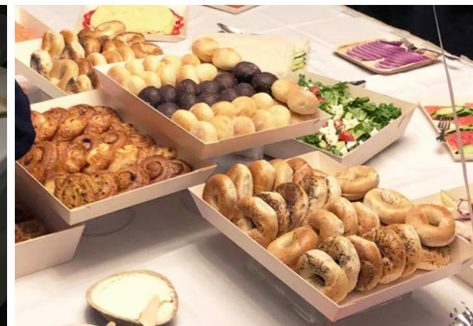
sku TG-CS-IX5, TG-SE-I2S