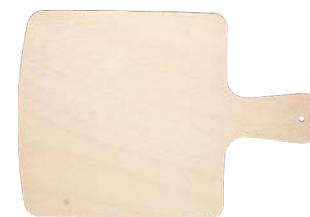
8"x 8" BOARD sku CB-SQ-8X8 Qty: 100