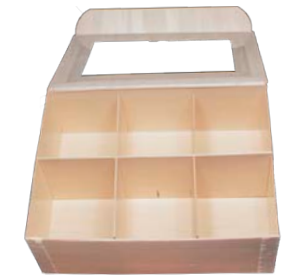
8" x 11" LARGE VENTO™ BOX W/ WINDOW LID sku WB-BB-8XI Qty: 50