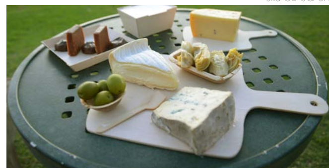
sku CB-SQ-8X8, 01-22-05B, TG-SE-5X5, TG-LB-3X4, CB-SQ-5X5