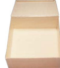
7" x 7" MEDIUM SQUARE sku TG-CB-7X7 Qty: 300