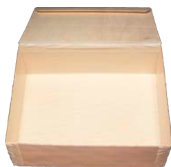
6" x 8" MEDIUM RECTANGLE sku TG-CB-6X8 Qty: 300