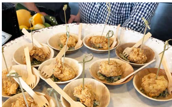
sku 01-01-10B, VT-2406

Our minis have become the tasting industry standard with over 500+ major events using our products, such as: Aspen F&W, Feast Portland, Palm Beach Food and Wine, and more. Our "smalls" the 2.5", 3", 3.5", 4", and 6" products make it easy for you to run a compostable event, lowering staffing needs, and the added bonus of gorgeous food images. Our smalls will showcase the food and your event in the best light.