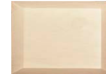
5"x 7" MEDIUM RECTANGLE sku TG-DE-5X7 Qty: 300