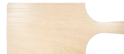
8" x 12" BOARD sku CB-RC-8X2 Qty: 100