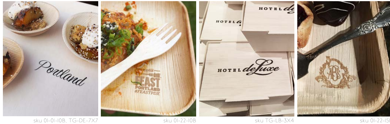
sku 01-01-10B, TG-DE-7X7

Our Balsa wood products are treated with a special silk screen to apply your logo in an elegant way. Our facilities are food safe and we have an installed capacity of 75,000 units a day and growing. Between our capacity and quality, we have all your needs covered.