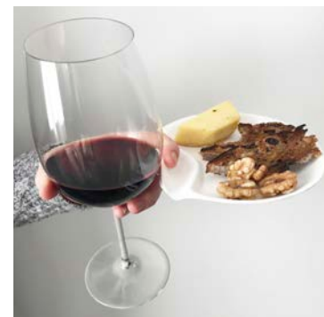
WINE GLASS HOLD-A-PLATE™