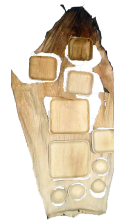
Palm leaf becoming VerTerra Dinnerware

Soil containing VerTerra compost enhances plant growth by 15%.