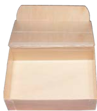
4" x 6" SMALL RECTANGLE sku TG-CB-4X6 Qty: 300