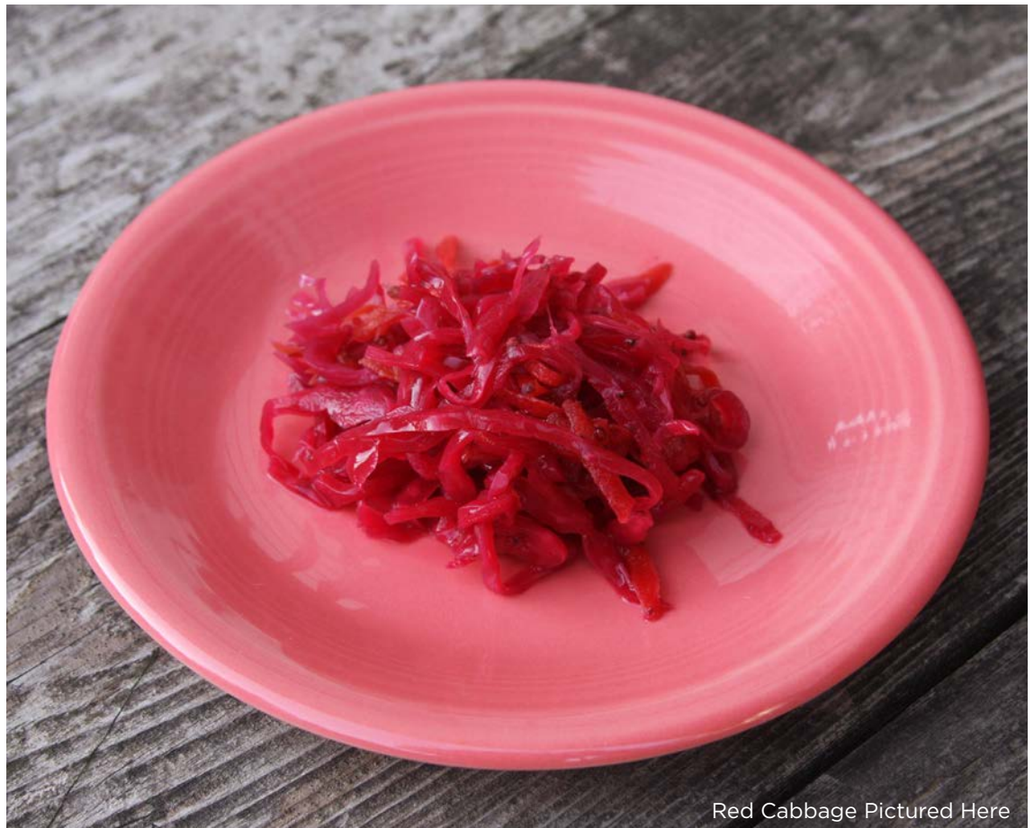
Red Cabbage Pictured Here

Once your sauerkraut has fully fermented, remove the Pickle Pipe and Pickle Pebble. Seal the jar with the original lid and ring, and transfer to the fridge for storage.