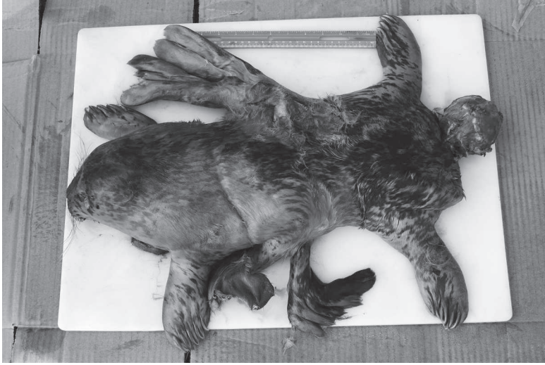
FIGURE 1. Gross view of conjoined fetal twins in a harbor seal ( Phoca vitulina ) from San Juan County, Washington, USA.

amount of sternal blubber (1.1 cm) and a weight of 11 kg. The fetuses were incompletely developed, as evidenced by the presence of a partial lanugo coat and deciduous incisors. Both hearts had a patent ductus arteriosus and a patent foramen ovale. A single umbilicus and several organs were torn from the body, making it difficult to identify complete sets of all internal organs. Nevertheless, both fetuses had a complete diaphragm, heart, and lungs that sank in formalin. Within the shared thoracic/abdominal area, there were two colons containing meconium and lanugo coat, suggesting that both fetuses had complete GI tracts before umbilical tearing. There were also two livers, two spleens, and four kidneys, but there was no visible bladder for the fetus with the caudally presenting head. Each fetus had a penis and two testicles.