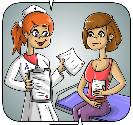
Oh yes, definitely.

Heat and moisture on fresh wounds can cause infections or other problems that we want to avoid after surgery.