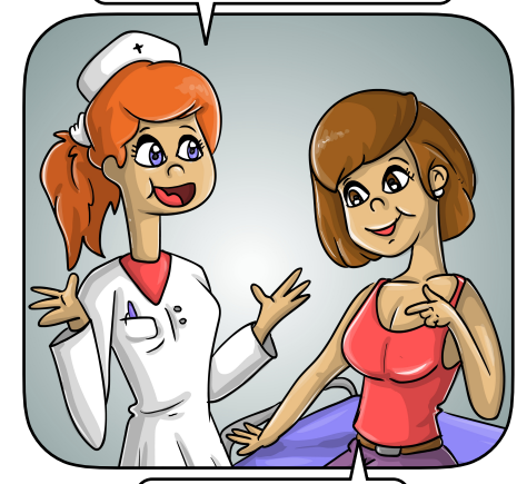
Yes, I think all women can relate to that.

Because standard bras create cleavage. You have probably experienced heat build-up and moisture there, right?