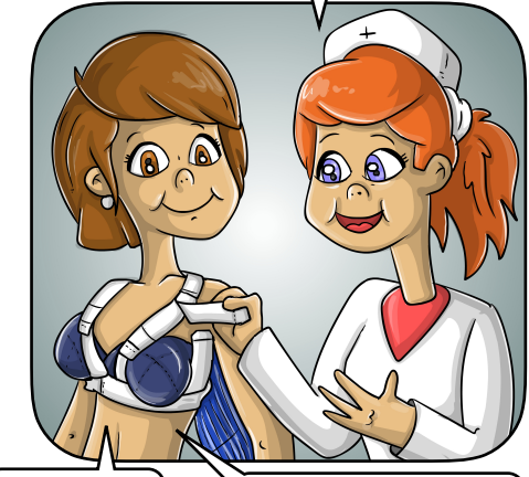
It feels very comfortable and soft.