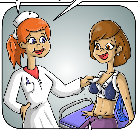
That would be fantastic! I worry about having an ugly scar afterwards.

Yes, and we can also regulate the bra at the sides of the breast like this. It will prevent the breast weight from pulling on the wound.