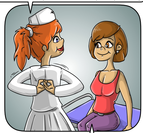
I understand. So what is different about the bra I have to use?

Also, normal bras close behind your back. After surgery, you have to avoid reaching behind your back like this while your breast bone is healing as that strains your bone and may delay healing.