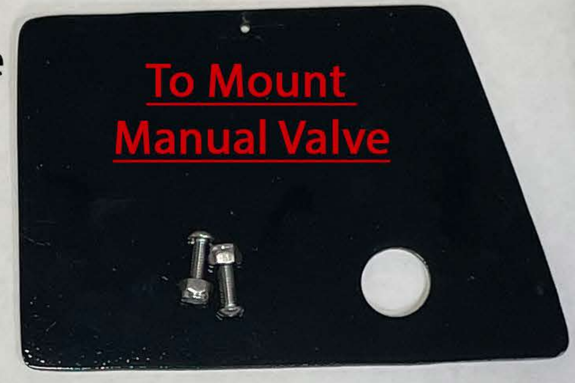
To Mount Manual Valve