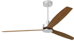
Ultra Pure 5