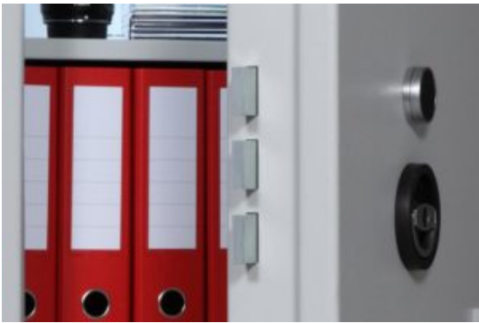
Euro Grade Square Boltwork