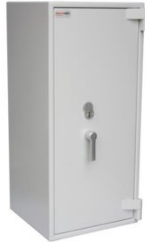
Euro Grade 1180