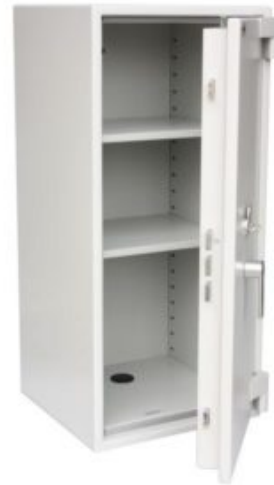
Euro Grade 1180