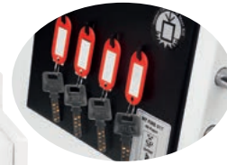
Internal Key Hooks