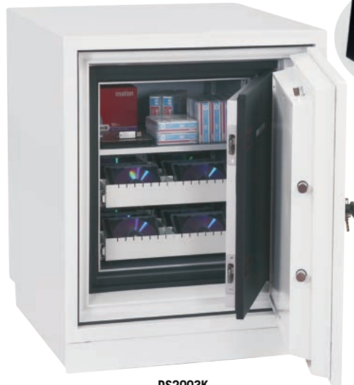
DS2003K Shown with optional extra multimedia trays