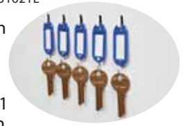
Internal Key Hooks