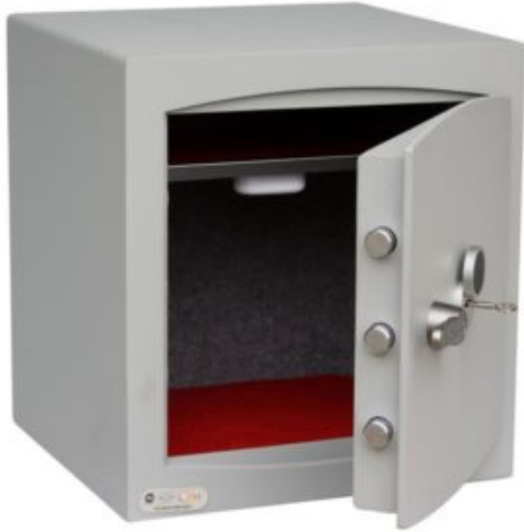
Mini Vault 3 S2 Silver Key Locking