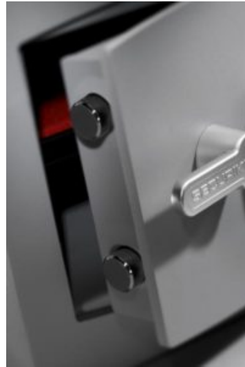
Mini Vault Bolts & Handle