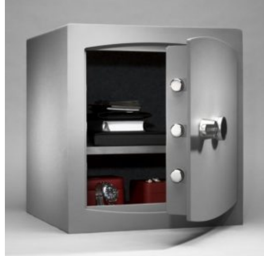
Mini Vault 3 S2 Key Locking Safe