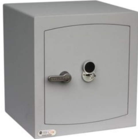
Mini Vault 3 S2 Silver Key Locking