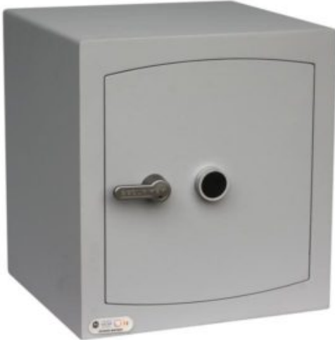
Mini Vault 3 S2 Silver Key Locking