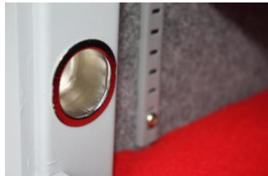
Mini Vault Chrome Bolt Cup