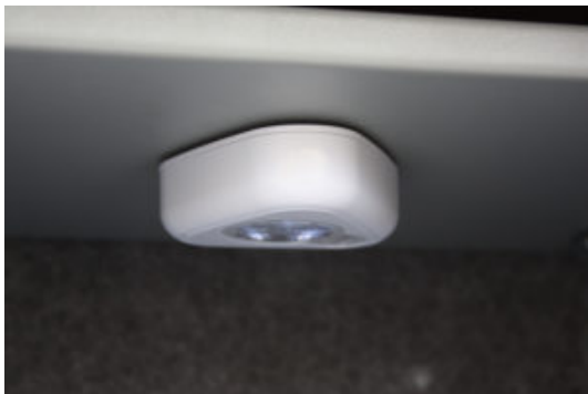
Motion Activated Magnetic Light