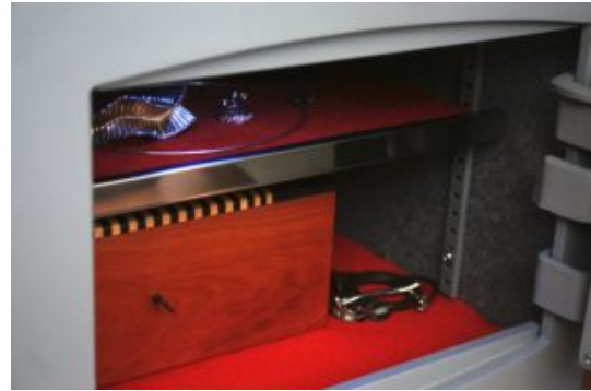
Mini Vault Jewellery Shelf